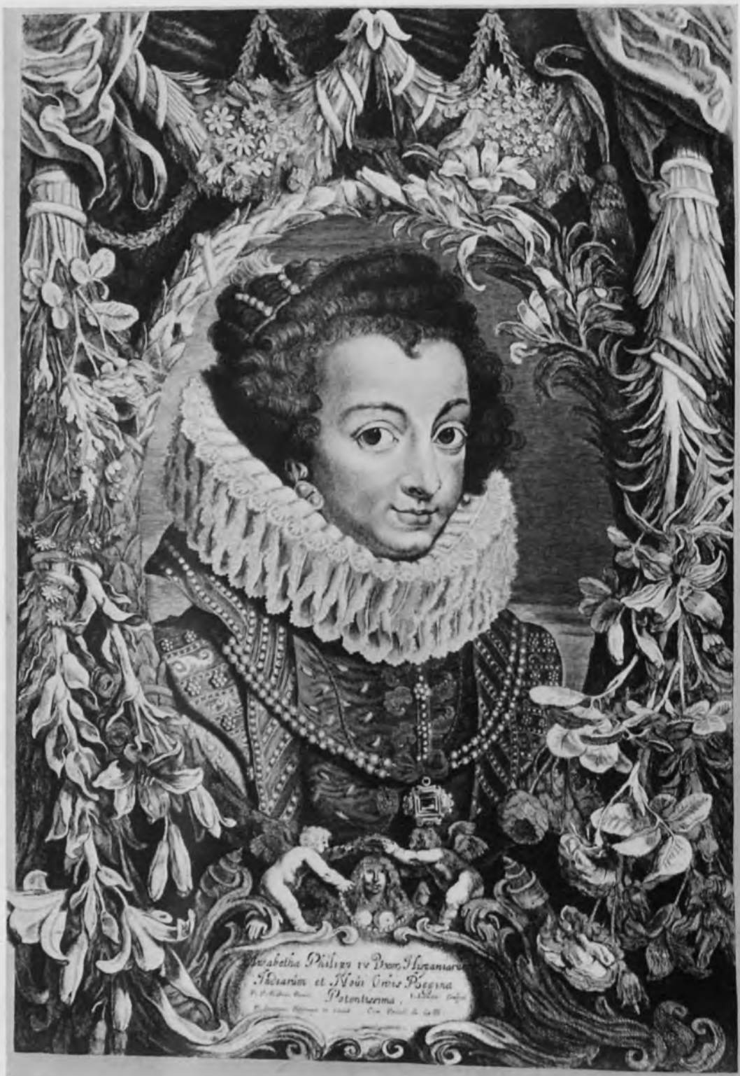
113. J. Louys, Isabella of Bourbon, Queen of Spain , engraving (No. 36)