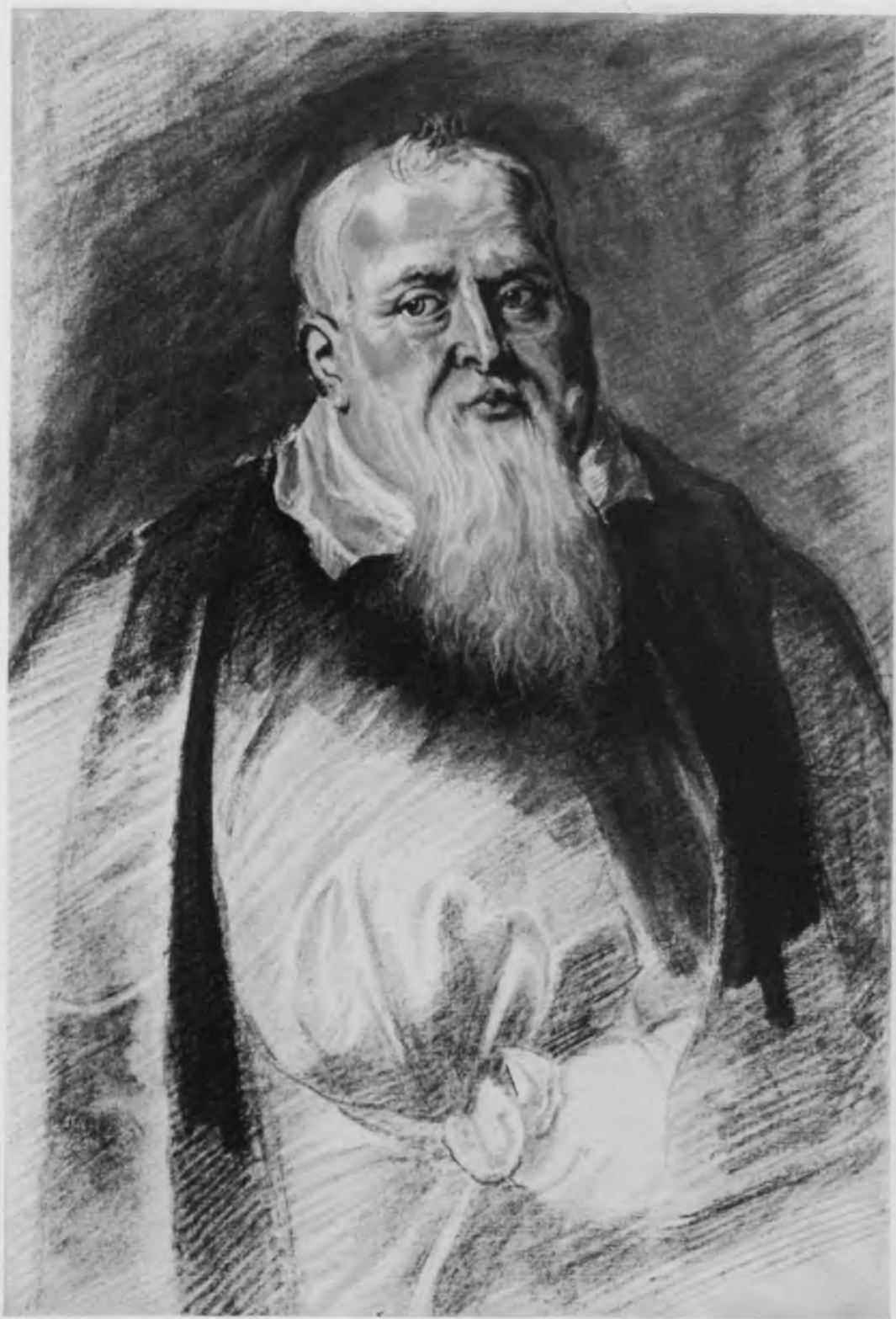
127. Rubens, Théodore Turquet de Mayerne , drawing (No. 46a). London, British Museum