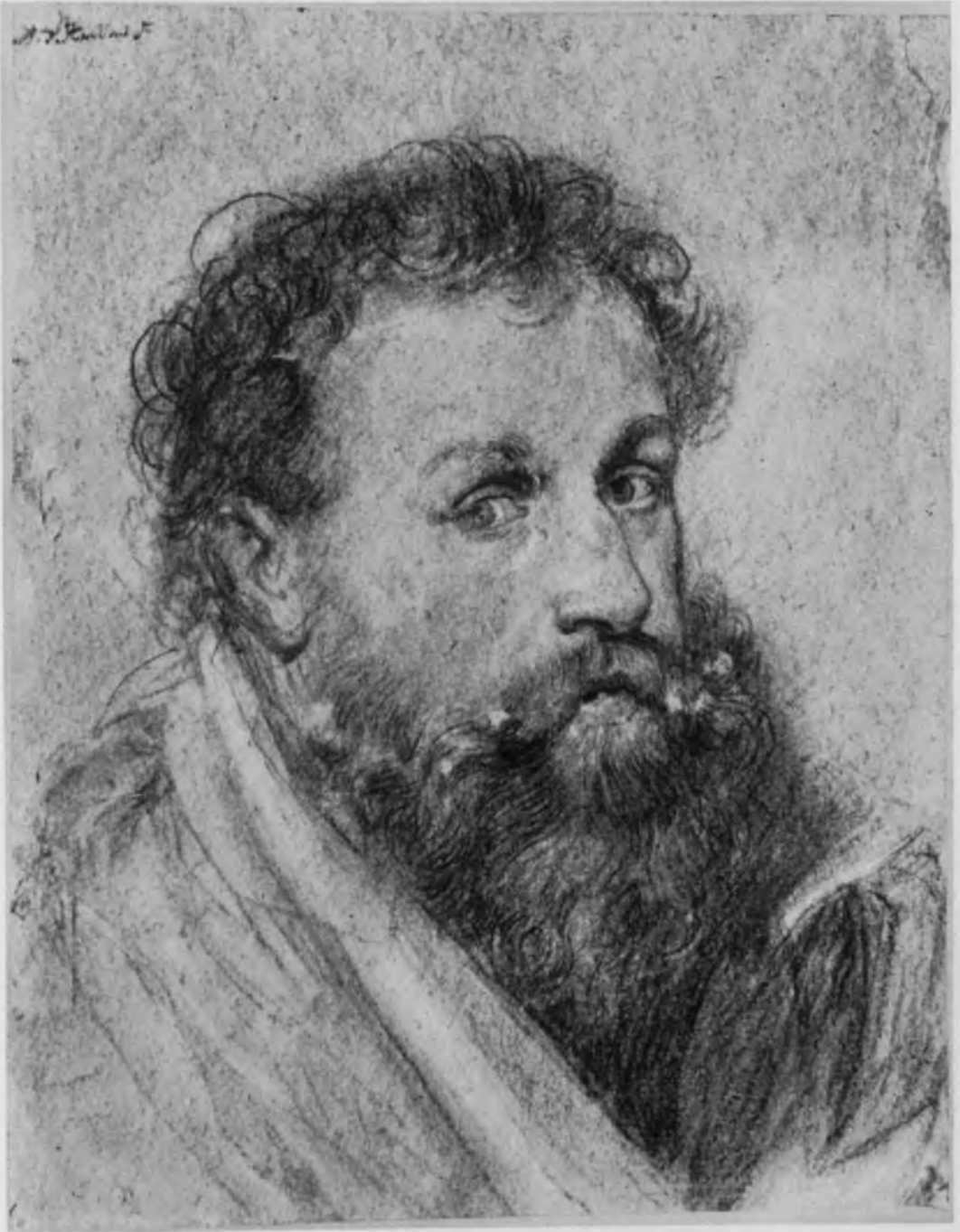
131. Rubens, Bearded Man , drawing (No. 51). Vienna, Albertina