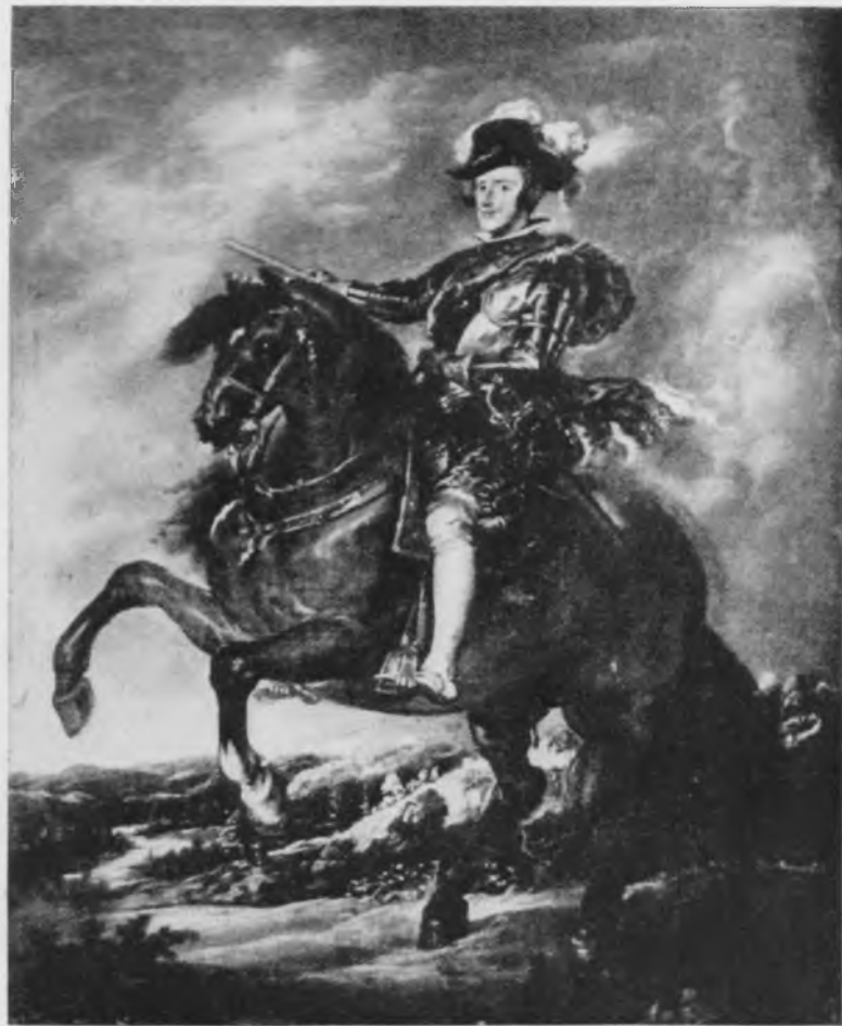
92. After Rubens, Philip IV, King of Spain, on Horseback (No. 30). Whereabouts unknown