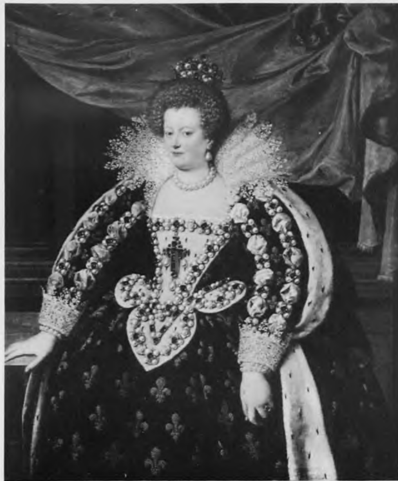
24. F. Pourbus the Younger, Maria de' Medici, Queen of France . Florence, Palazzo Medici-Riccardi