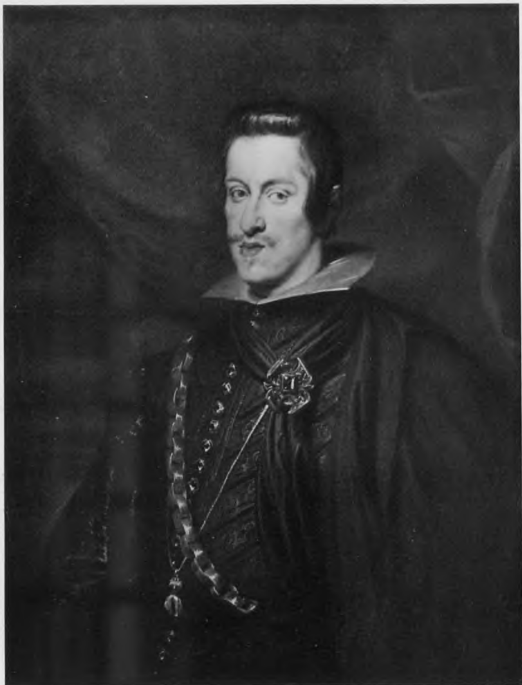
59. After Rubens, Don Carlos, Infante of Spain (No. 7). Whereabouts unknown