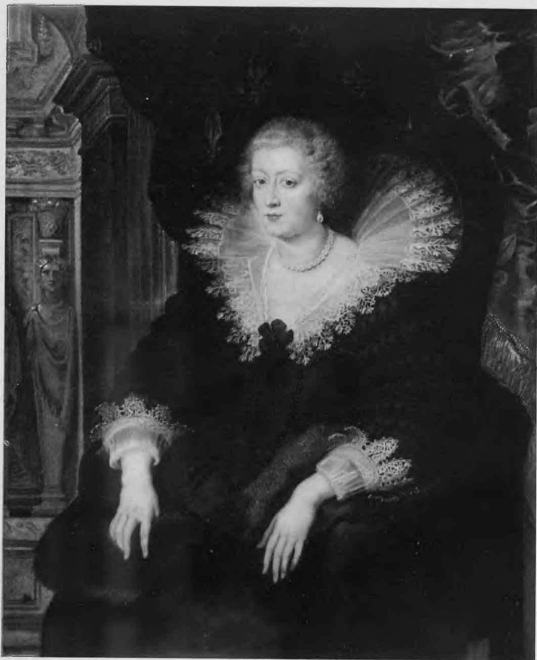
43. Rubens, Anne of Austria, Queen of France (No. 2). Madrid, Prado