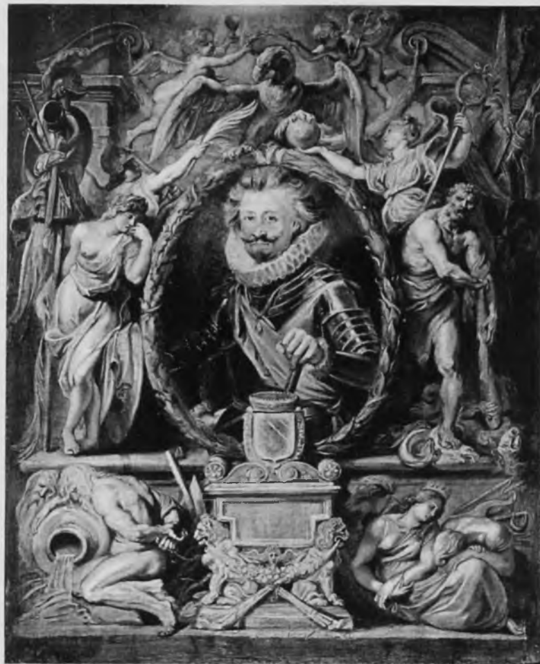
10. Rubens, Charles de Longueval, Count of Bucquoy , oil sketch. Leningrad, Hermitage