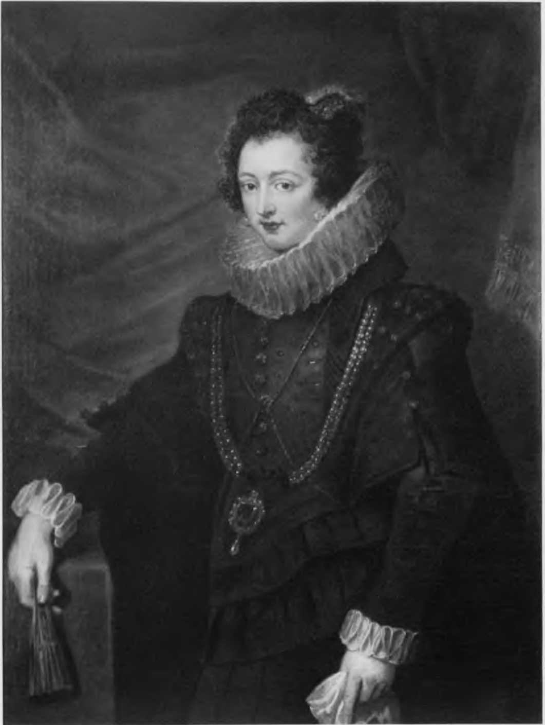
100. After Rubens, Isabella of Bourbon, Queen of Spain (No. 34). Munich, Alte Pinakothek