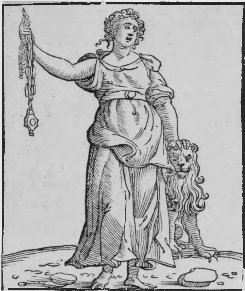
30. Generosity , woodcut (from C. Ripa, Iconologia , Padua, 1630, p. 287)