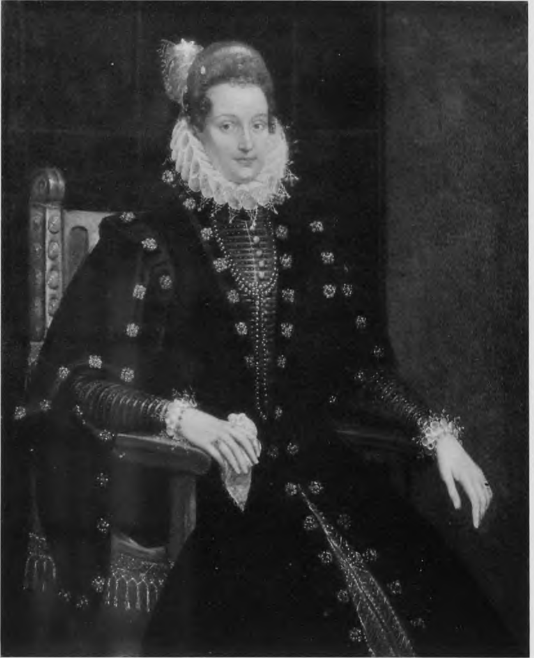
132. ? Rubens, A Lady (No. 54). Wollerau (Zürich), L. Spieser