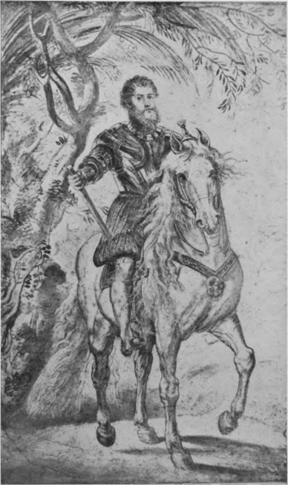
70. Rubens, A Rider on Horseback , drawing (No. 20b). Whereabouts unknown