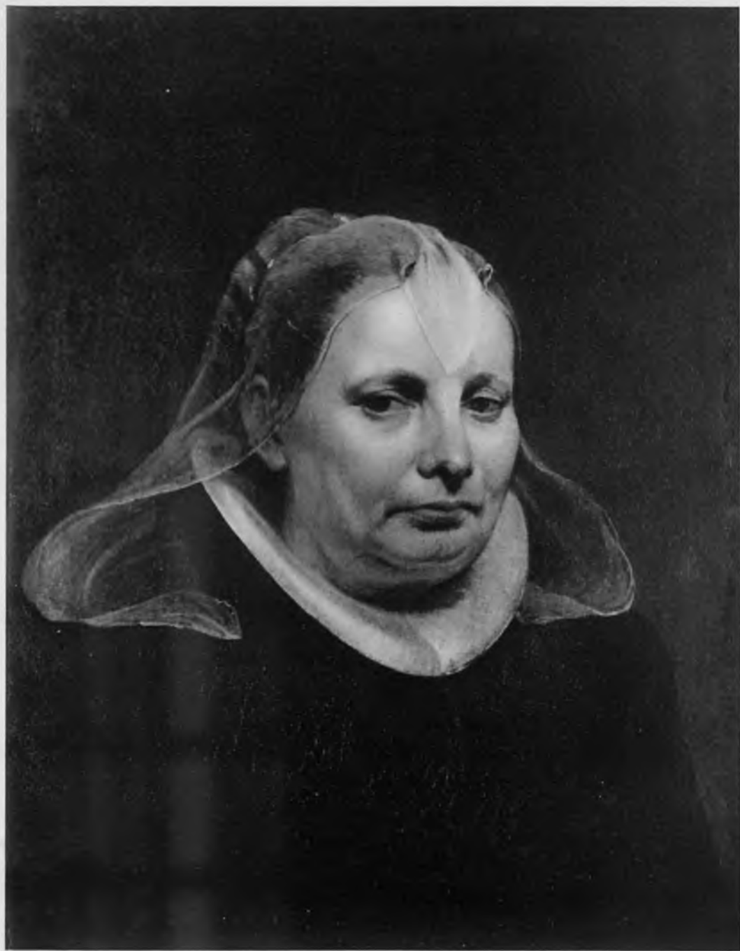
134. ? Rubens, An Old Lady (No. 56). Genoa, Palazzo Reale