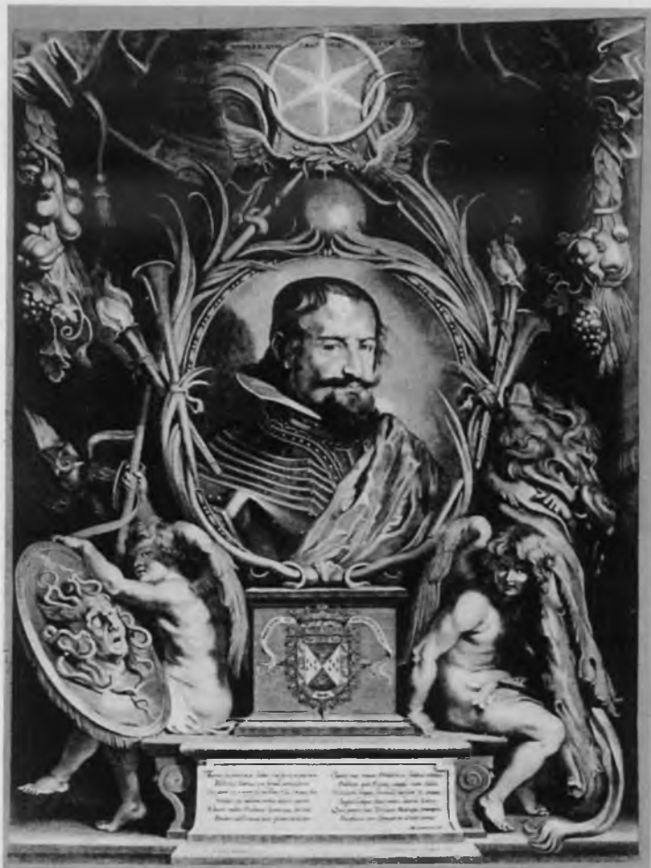
9. Rubens, Don Gaspar de Guzman, Count of Olivares and Duke of Sanlúcar , oil sketch. Brussels, Musées Royaux des Beaux-Arts