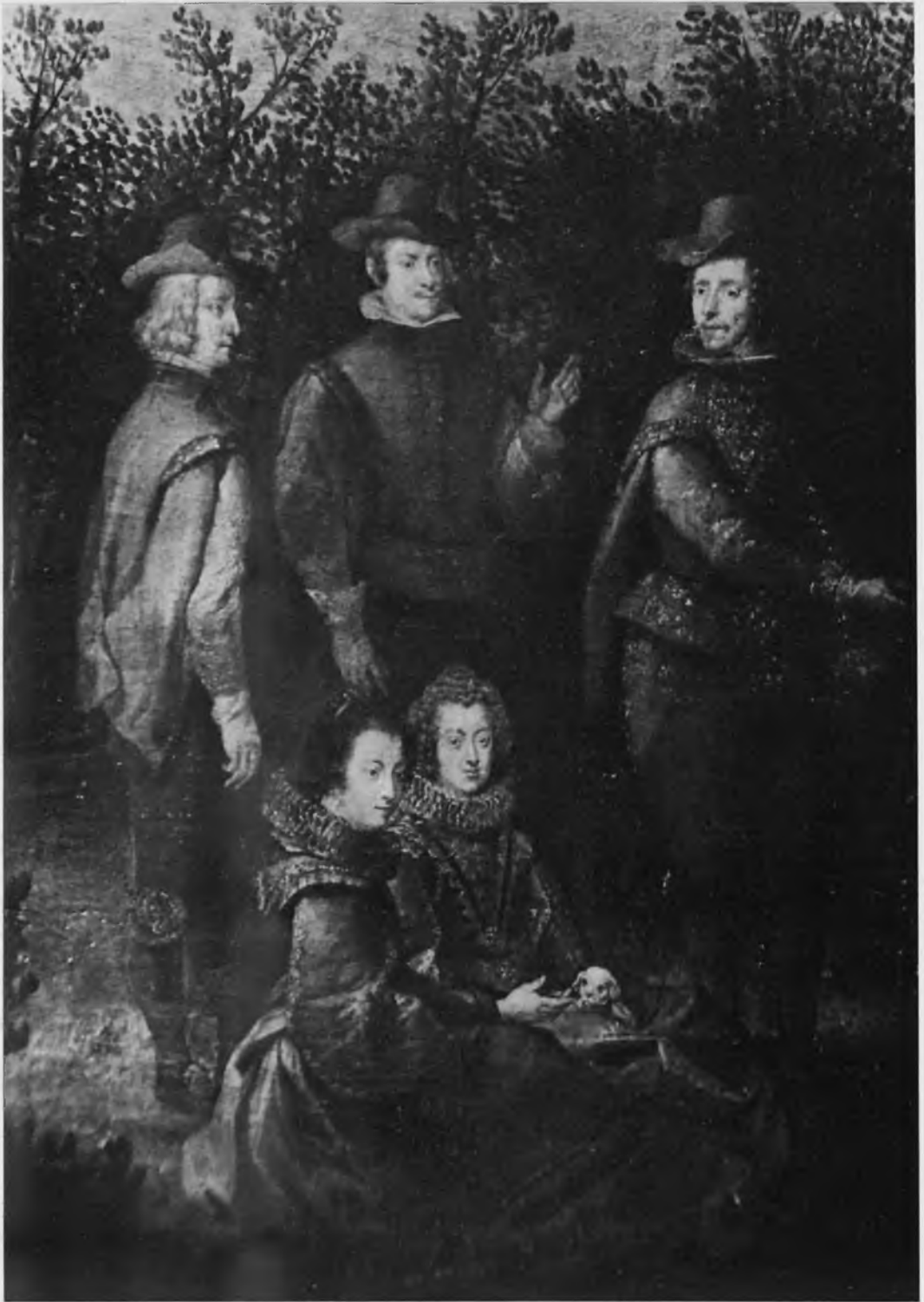
81. P. Snayers, Philip IV and his Family Hunting , detail. Madrid, Prado