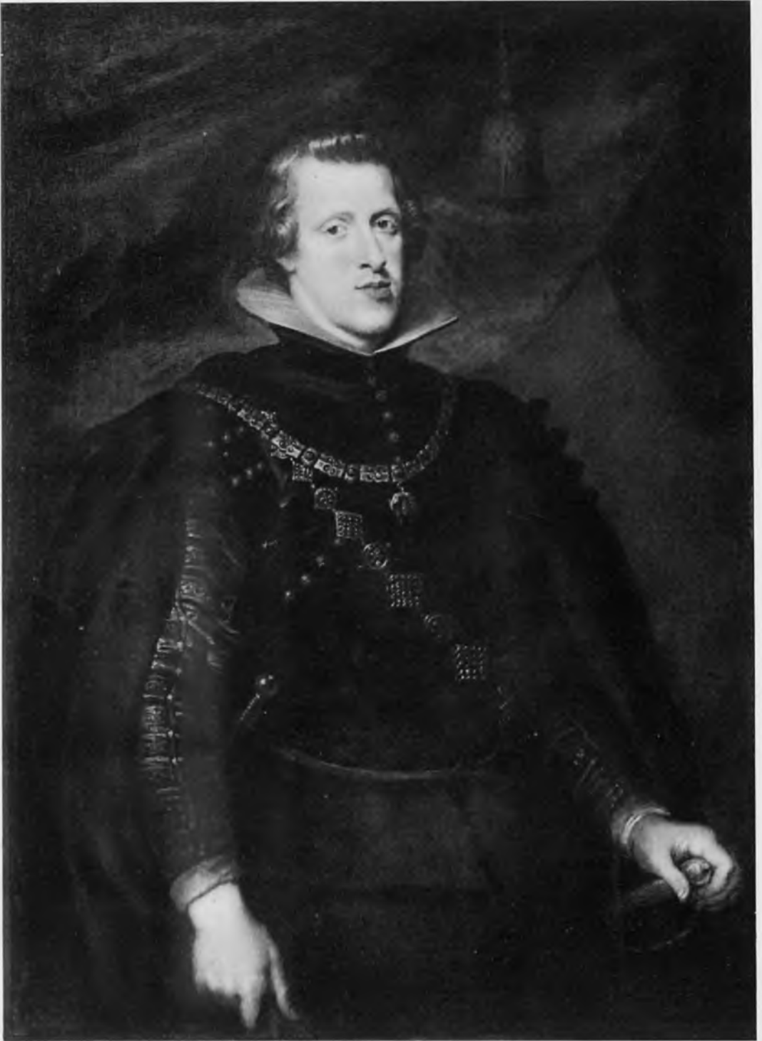
97. After Rubens, Philip IV, King of Spain (No. 33). Leningrad, Hermitage