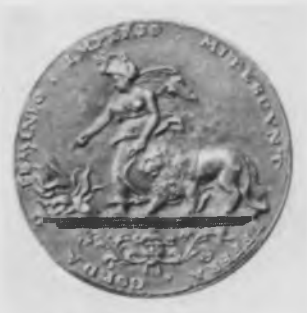
31. C. Weiditz, Generosity (?), medal. Stockholm, Royal Coin Cabinet