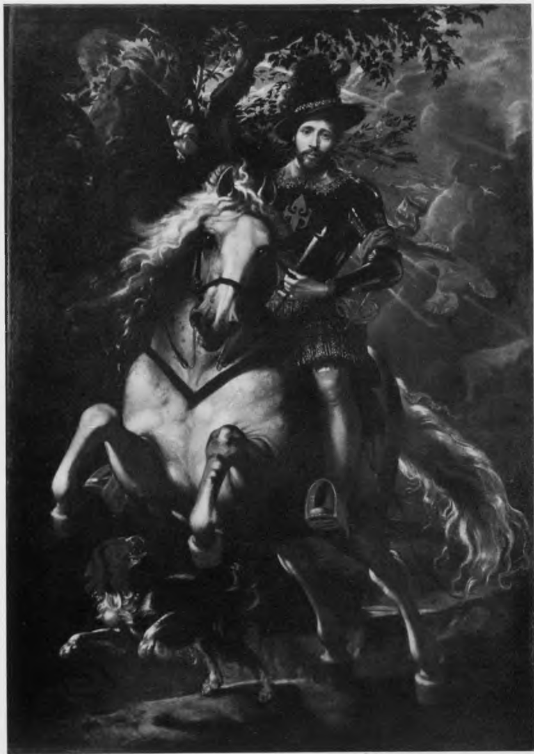
68. Rubens, Giancarlo Doria on Horseback (No. 10). Florence, Palazzo Vecchio