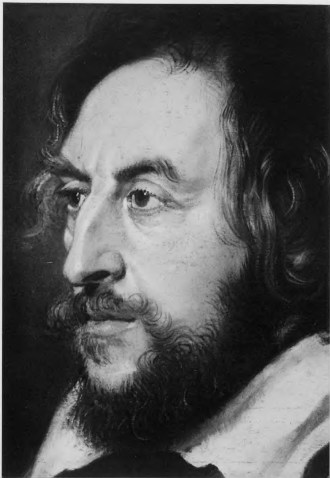
56. Detail of Fig. 48