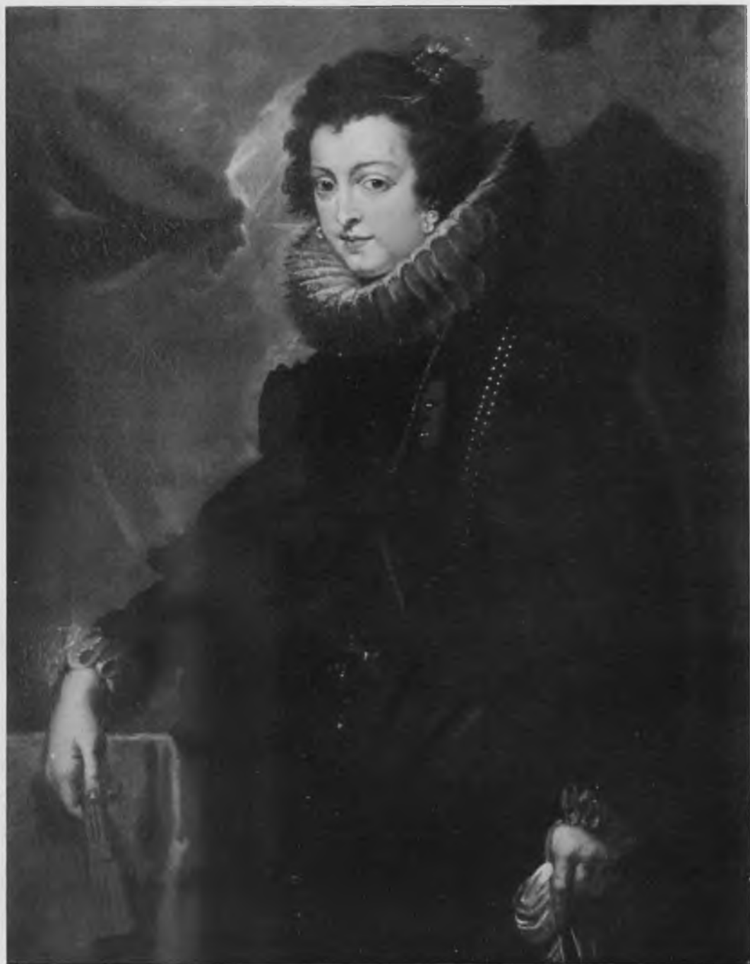
109. After Rubens, Isabella of Bourbon, Queen of Spain (No. 34). Pommersfelden, Castle Weissenstein, Count Schönborn