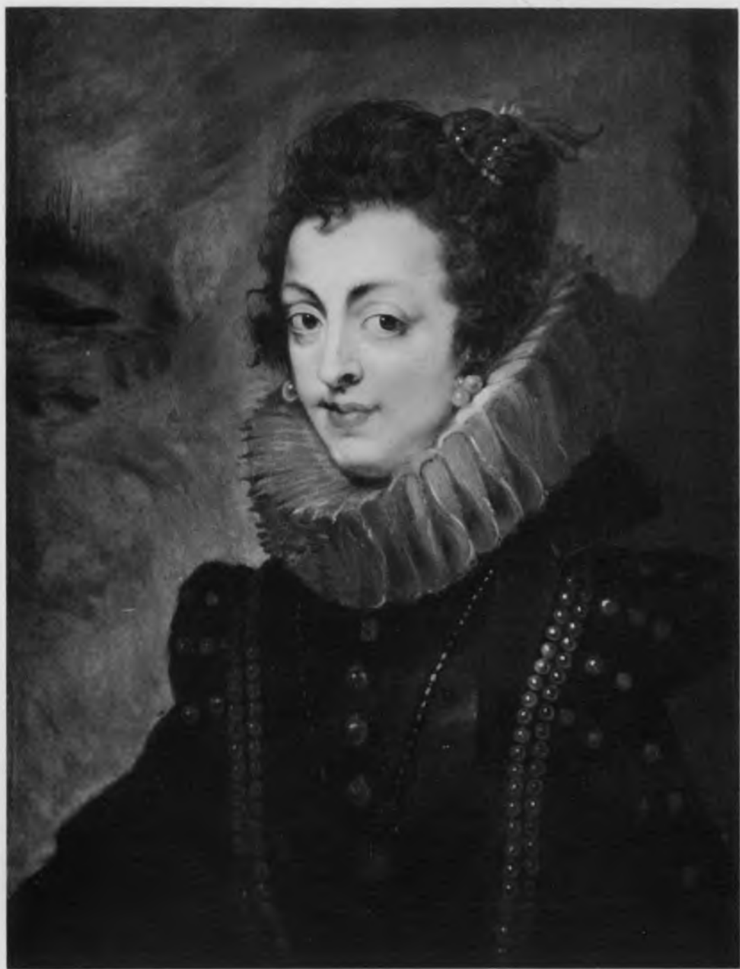
110. After Rubens, Isabella of Bourbon, Queen of Spain (No. 34). Chicago, The Art Institute