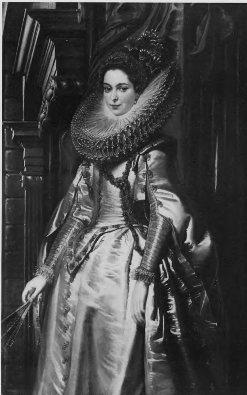
119. Rubens, Brigida Spinola Doria (No. 41). Washington, National Gallery of Art