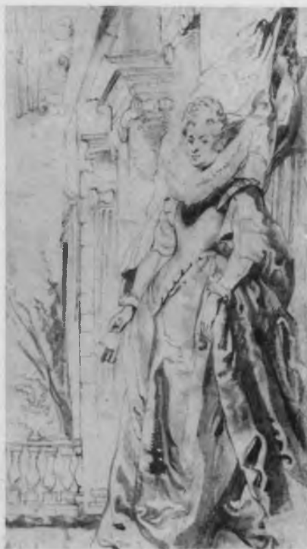
121. Rubens, A Lady , drawing (No. 41a). New York, Pierpont Morgan Library