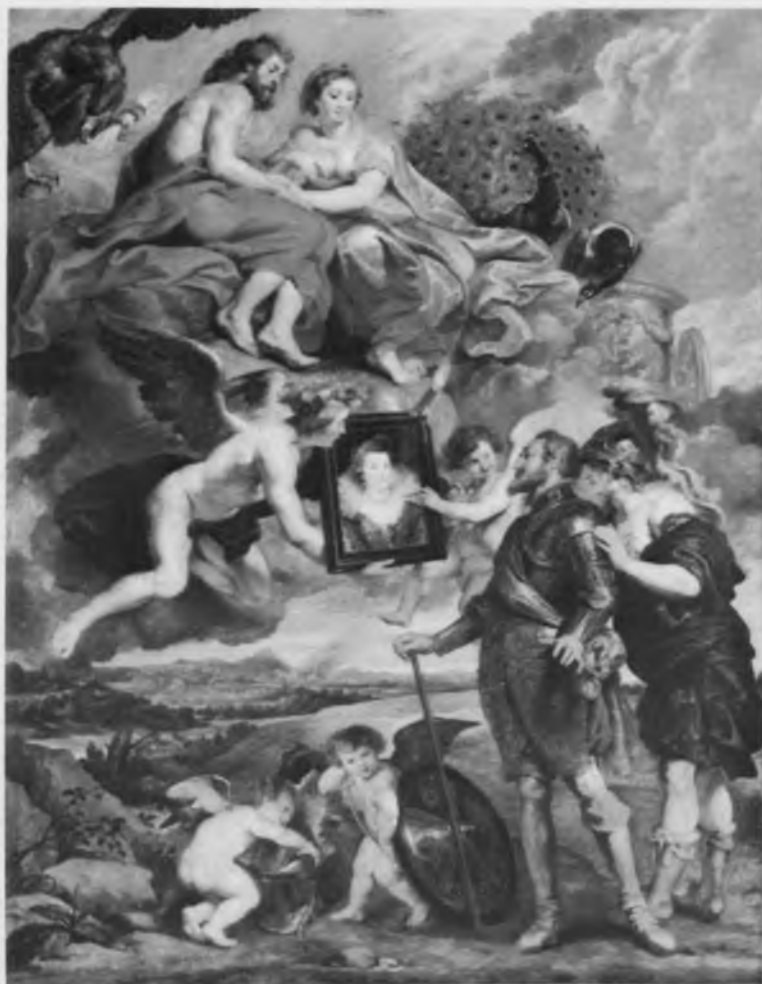
16. Rubens, Henri IV Viewing the Portrait of Maria de' Medici . Paris, Louvre