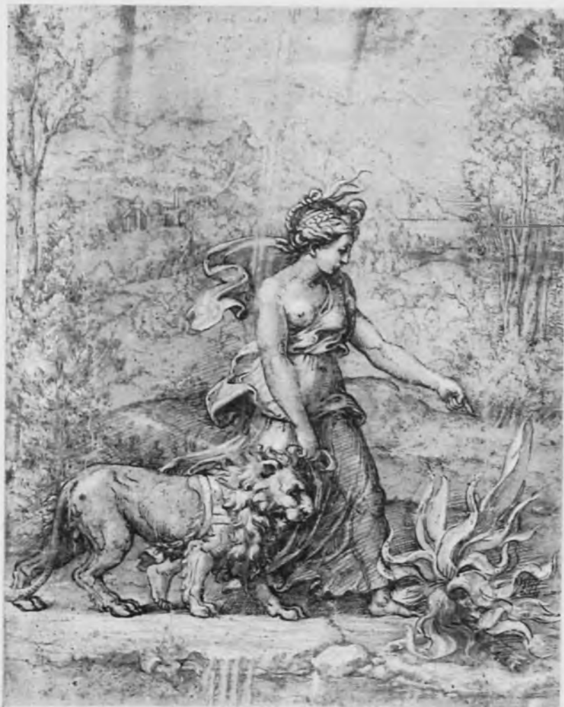
28. School of Raphael, Generosity (?) . Haarlem, Teylers Museum