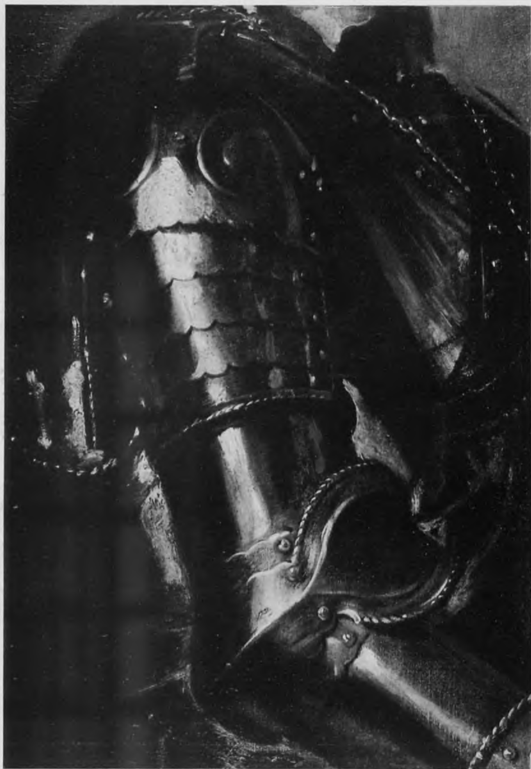
55. Detail of Fig. 52