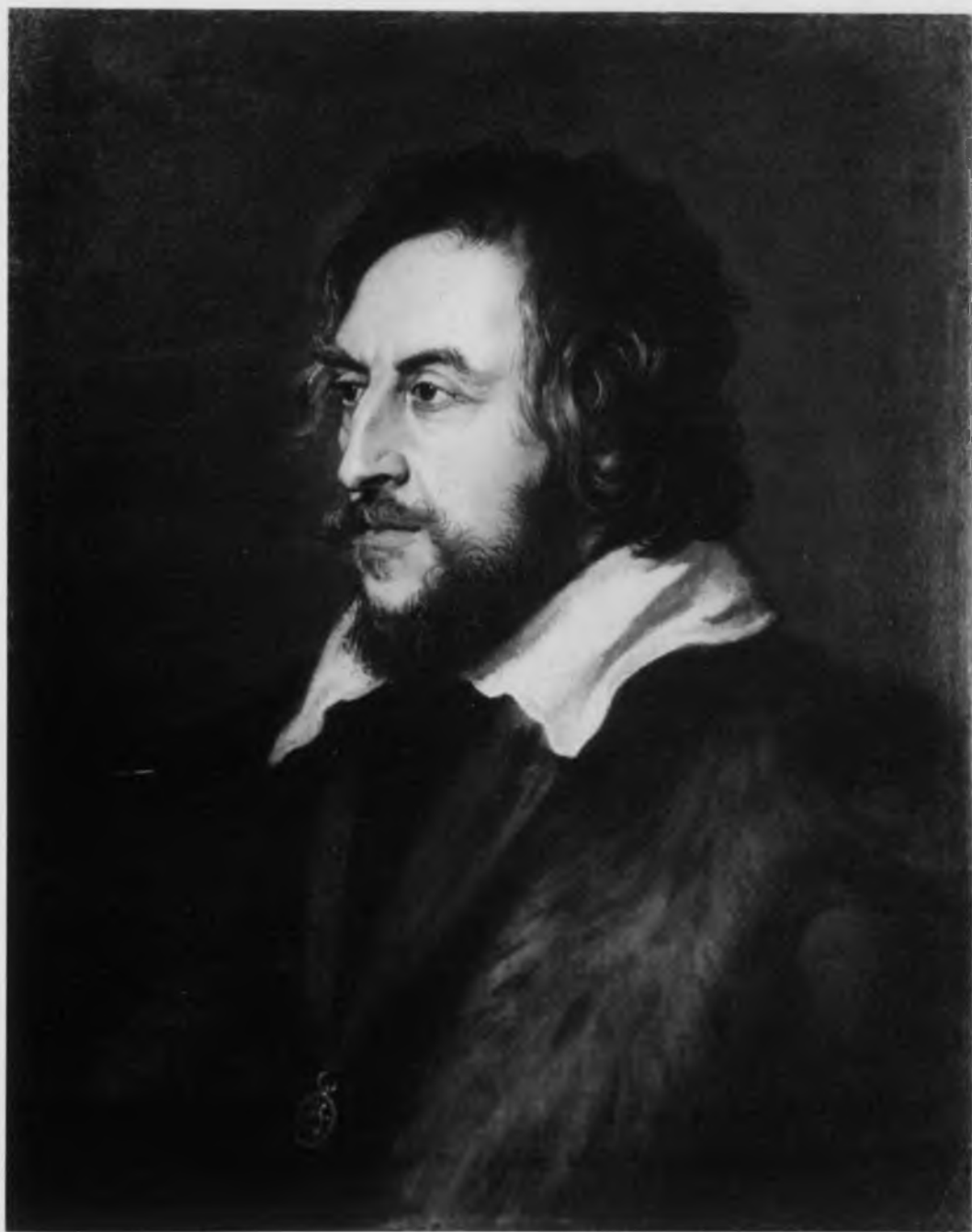
48. Rubens, Thomas Howard, Earl of Arundel (No. 4). London, National Gallery