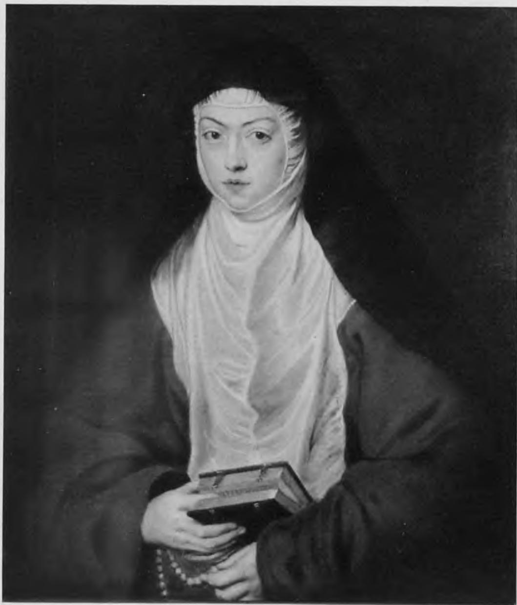
41. Rubens, Sor Ana Dorotea (No. 1). London, Apsley House