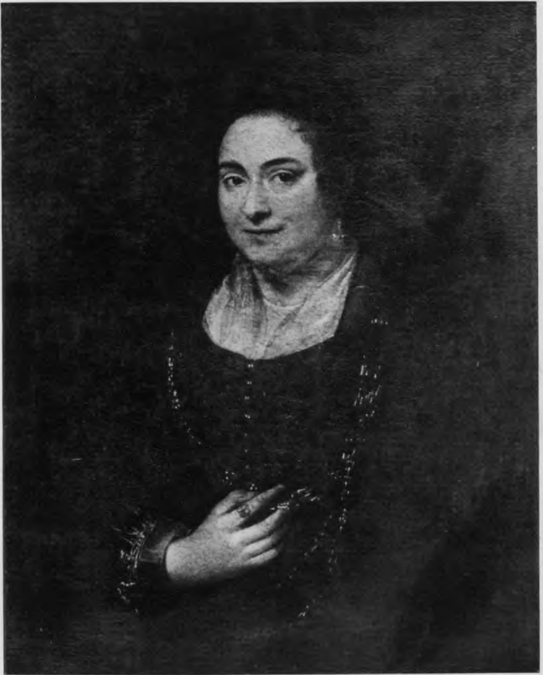
137. Rubens, A Lady (No. 53). Petworth House, Lord Egremont