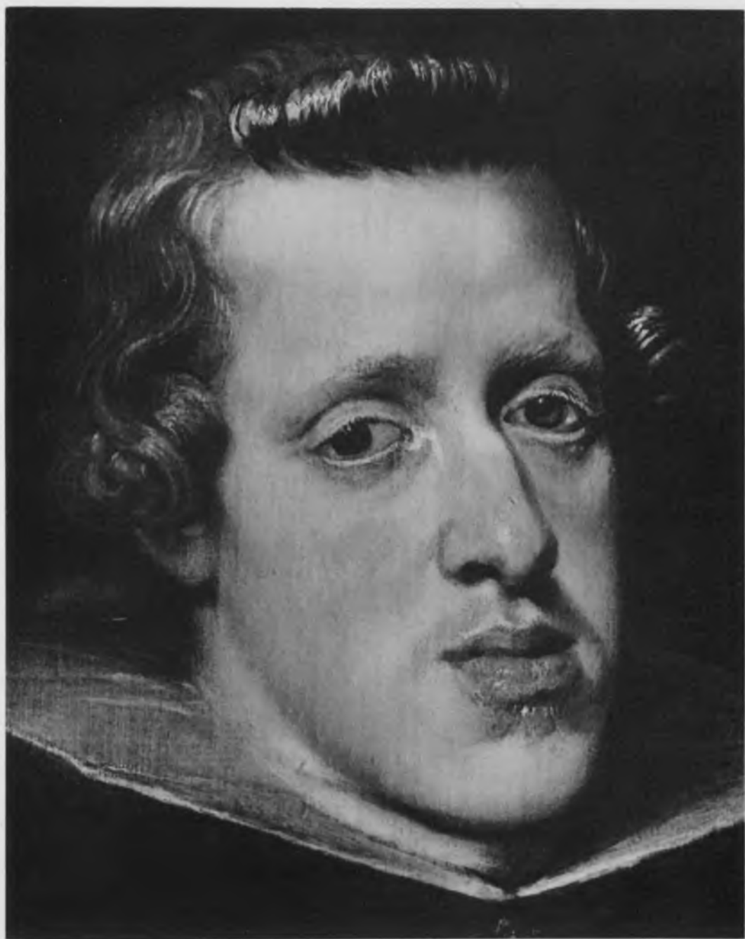
112. Detail of Fig. 111