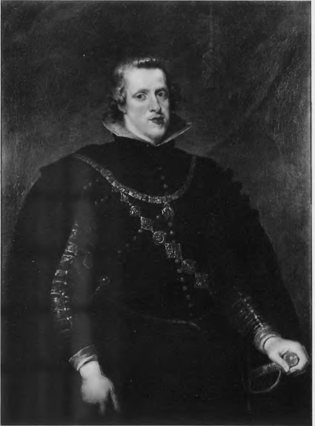
99. After Rubens, Philip IV, King of Spain (No. 33). Munich, Alte Pinakothek