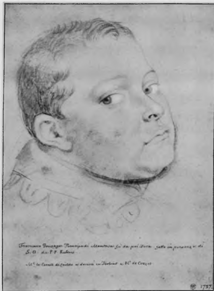
5. Rubens, Vincenzo Gonzaga the Younger , drawing. Stockholm, Nationalmuseum