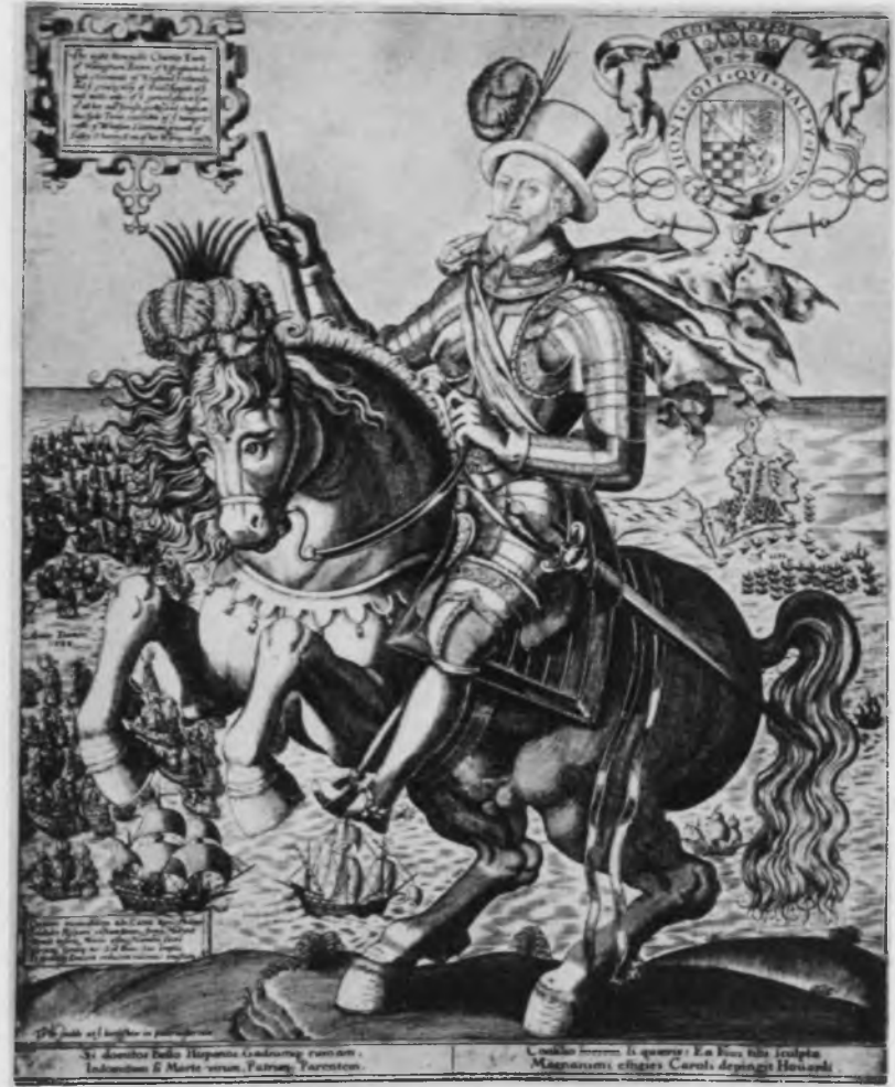
34. Charles, Earl of Nottingham , engraving