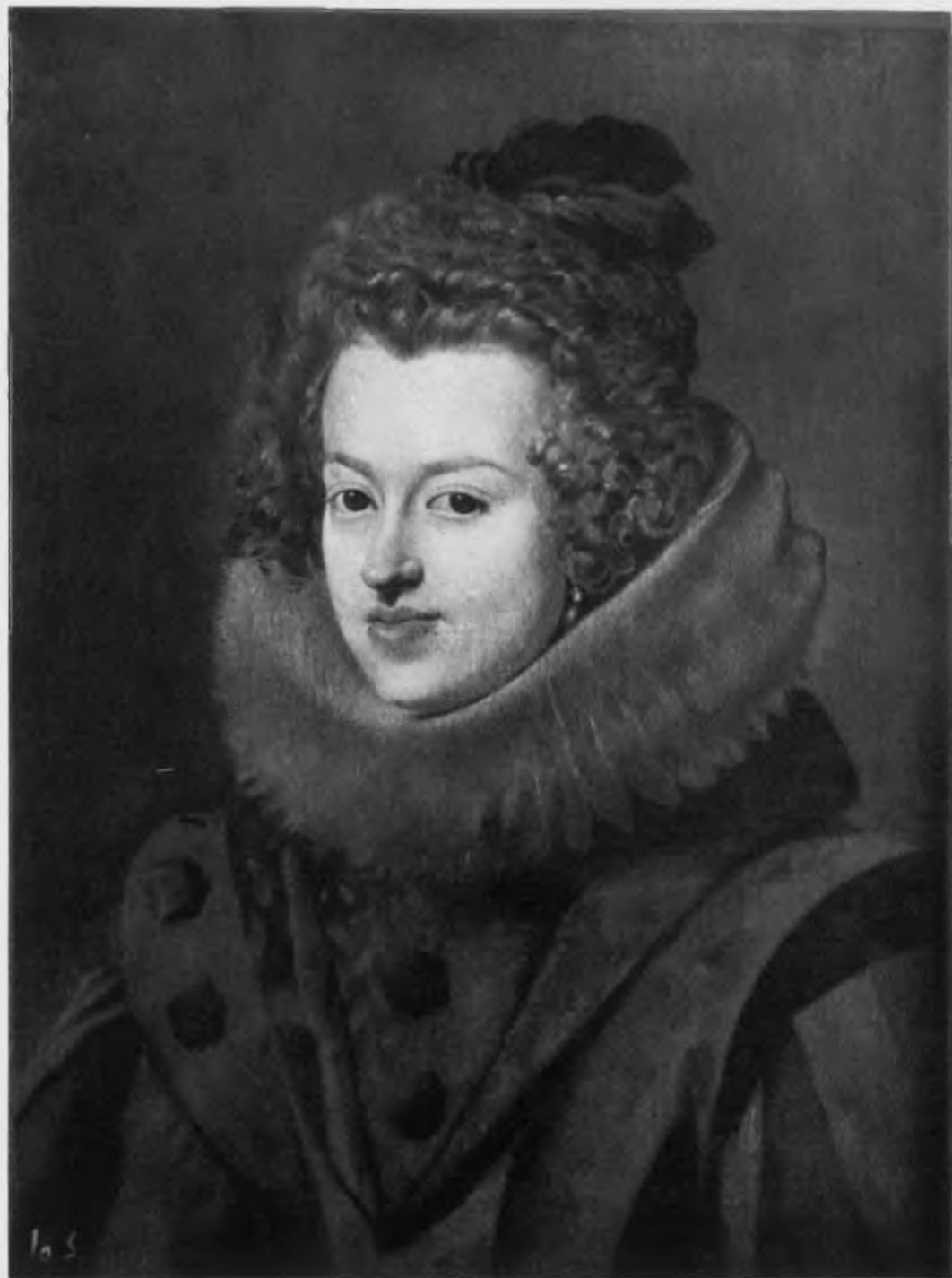
80. Velázquez, Maria, Infante of Spain, later Queen of Hungary and Bohemia . Madrid, Prado