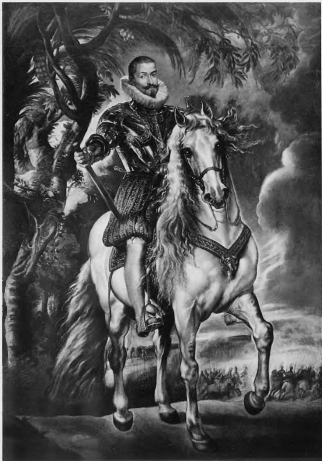
67. Rubens, Francesco Gomez de Sandoval y Rojas, Duke of Lerma, on Horseback (No. 20). Madrid, Prado