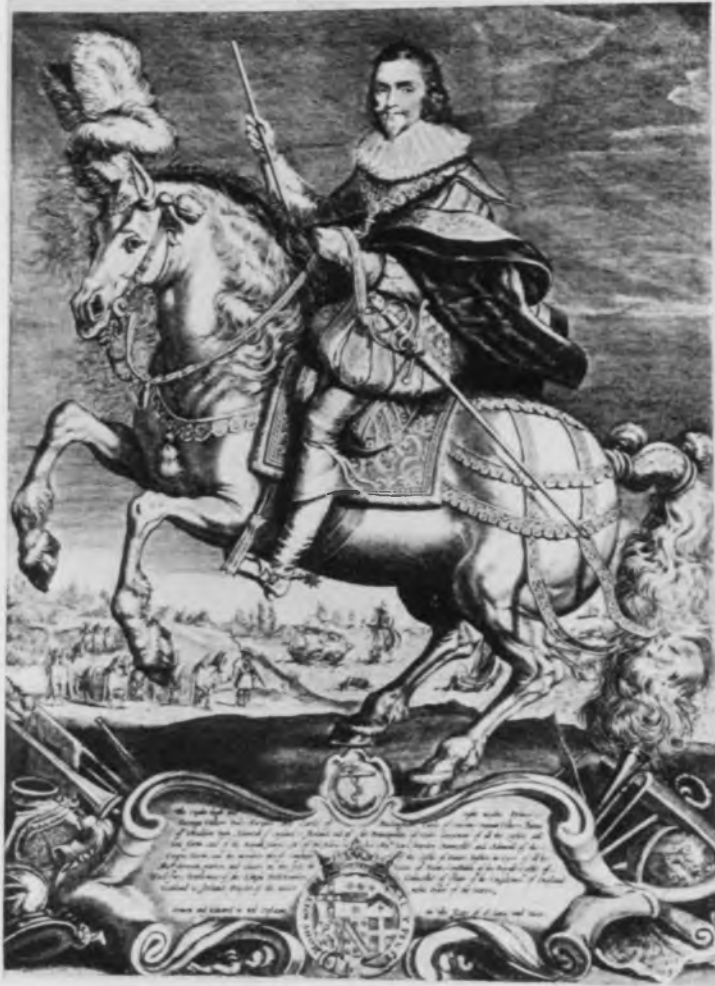
33. W. de Passe, George Villiers, Duke of Buckingham on Horseback , engraving