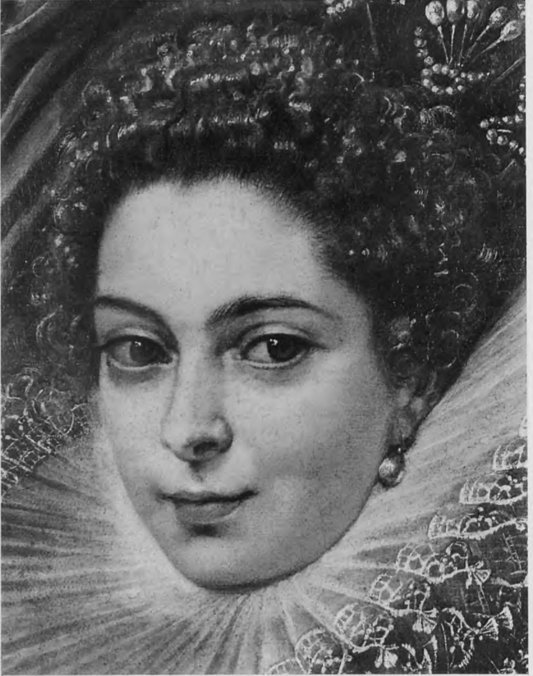
122. Detail of Fig. 119