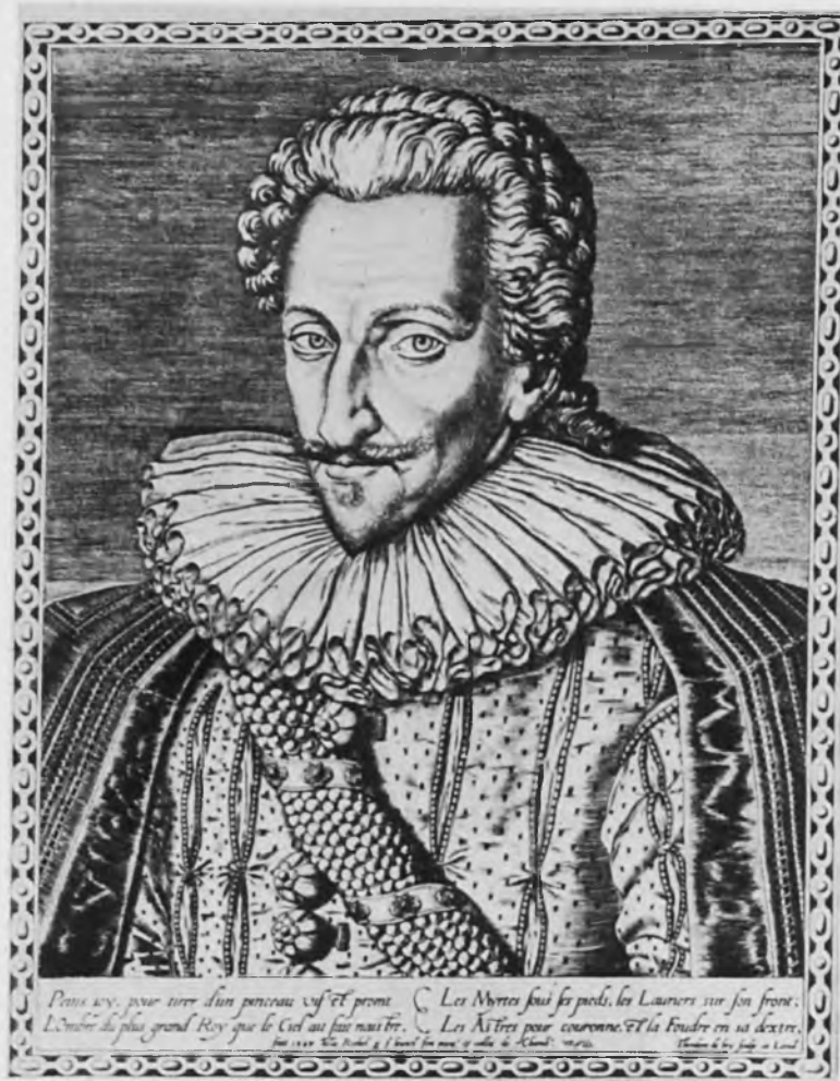
18. T. de Bry, Henri IV, King of Navarre , engraving