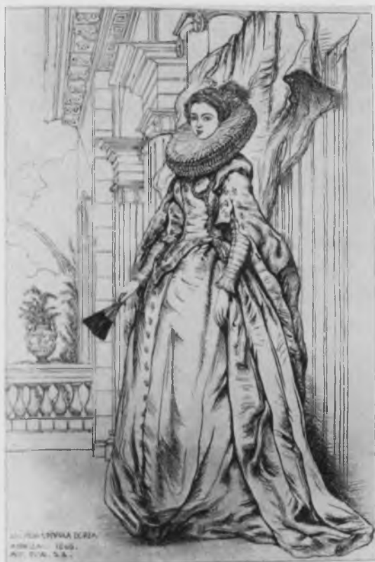
120. P.F. Lehnert, Brigida Spinola Doria , lithograph (No. 41)