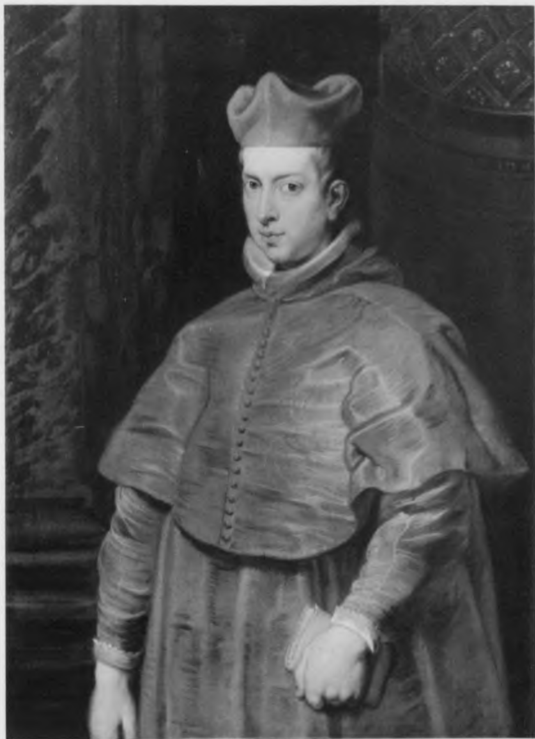
62. ? Rubens, Ferdinand, Cardinal-Infante of Spain (No. 13). Althorp, Earl Spencer