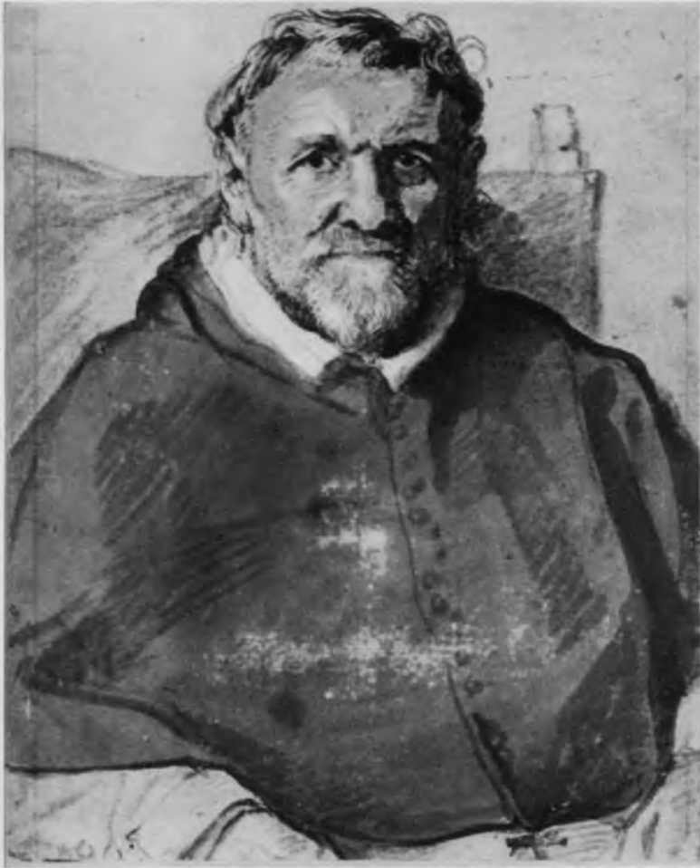
39. Rubens, Michael Ophovius , drawing. Paris, Cabinet des Dessins du Musée du Louvre