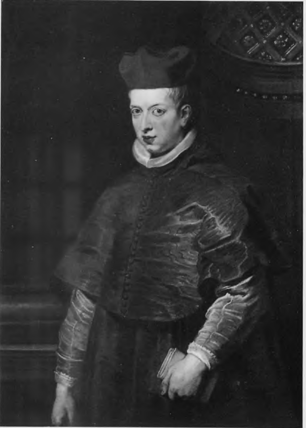
61. Rubens, Ferdinand, Cardinal-Infante of Spain (No. 12). Munich, Alte Pinakothek