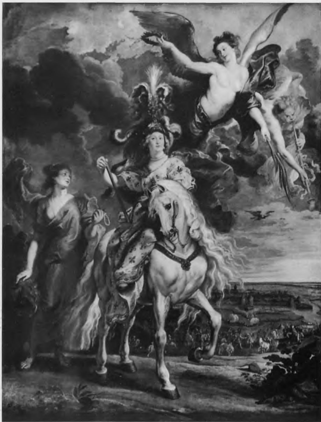
26. Rubens, The Triumph of Jilich . Paris, Louvre