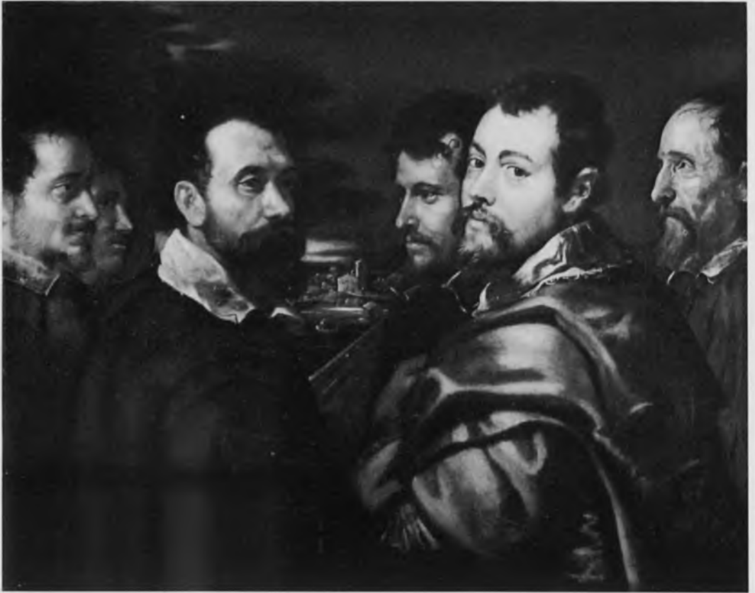
115. Rubens, Peter Paul Rubens in a Circle of Friends (No. 37).