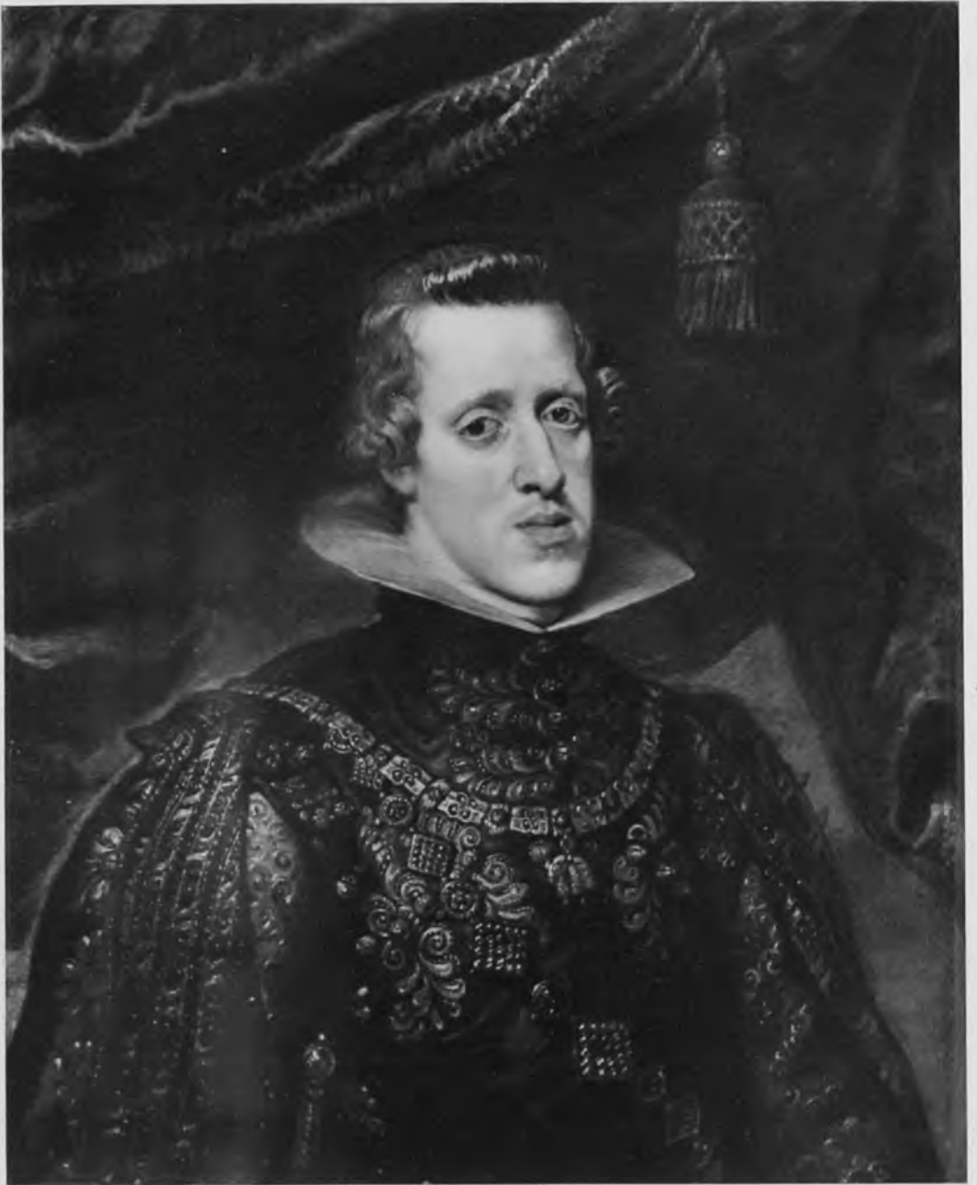
111. Rubens, Philip IV, King of Spain (No. 35). Zürich, Kunsthhaus, Ruzicka Stiftung