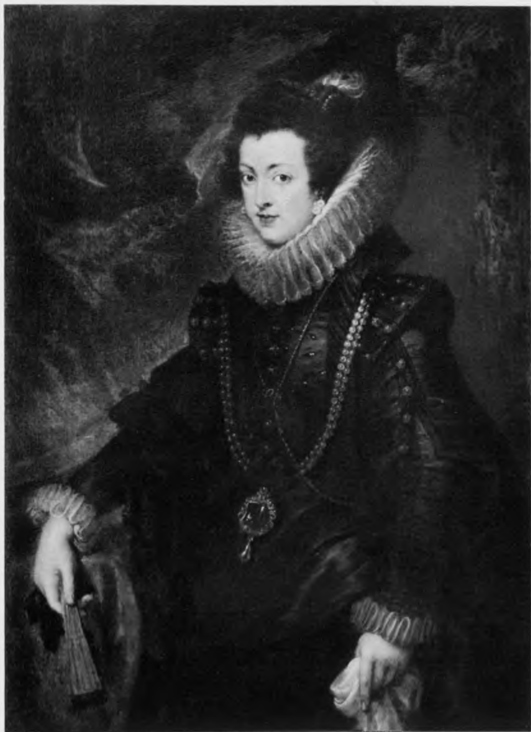
98. After Rubens, Isabella of Bourbon, Queen of Spain (No. 34). Leningrad, Hermitage