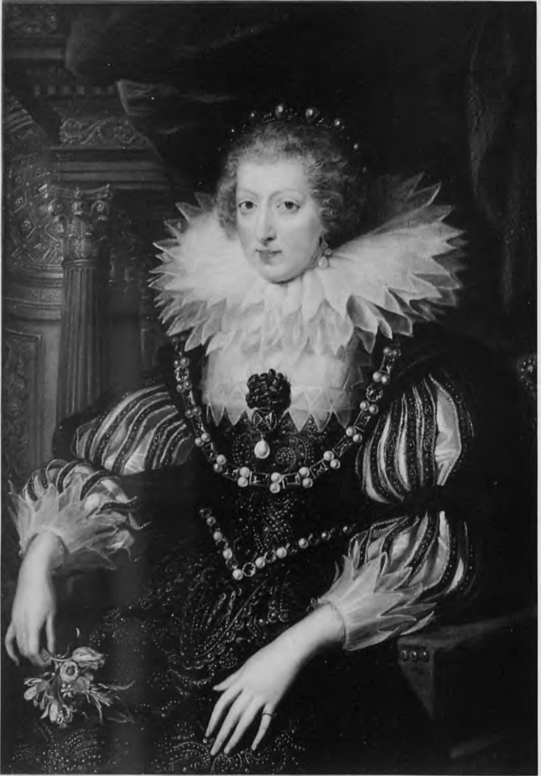
45. Rubens, Anne of Austria, Queen of France (No. 3). Amsterdam, Rijksmuseum