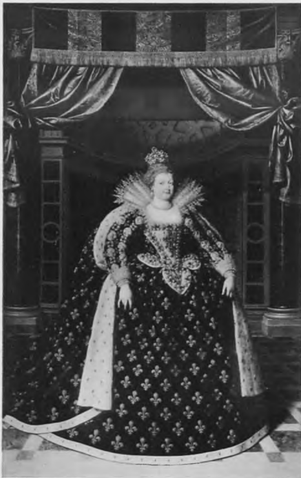
23. F. Pourbus the Younger, Maria de' Medici, Queen of France . Paris, Louvre