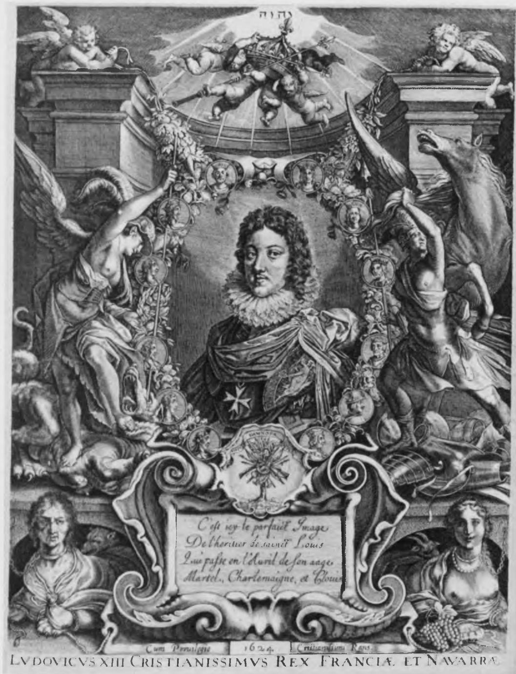
76. C. de Passe, Louis XIII, King of France , engraving (No. 21)