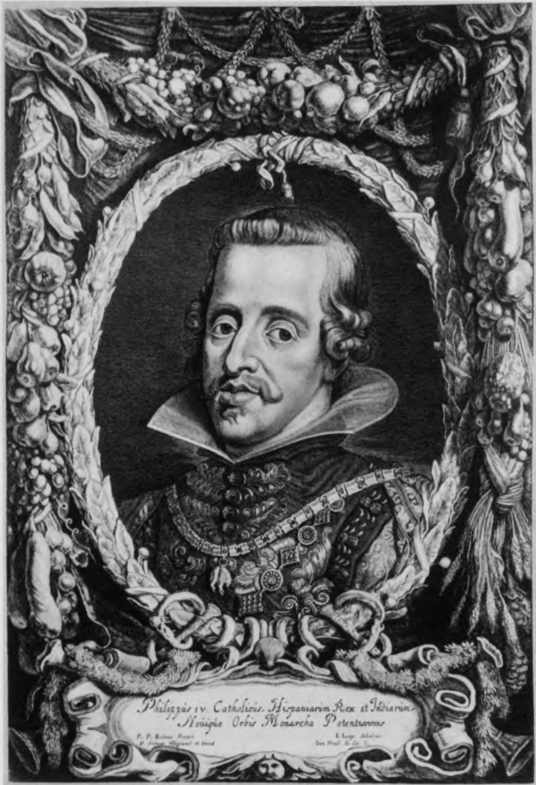
114. J. Louys, Philip IV, King of Spain , engraving (No. 35)