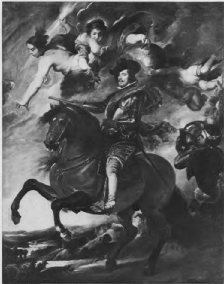
91. After Rubens, Philip IV, King of Spain, on Horseback (No. 30). Florence, Uffizi