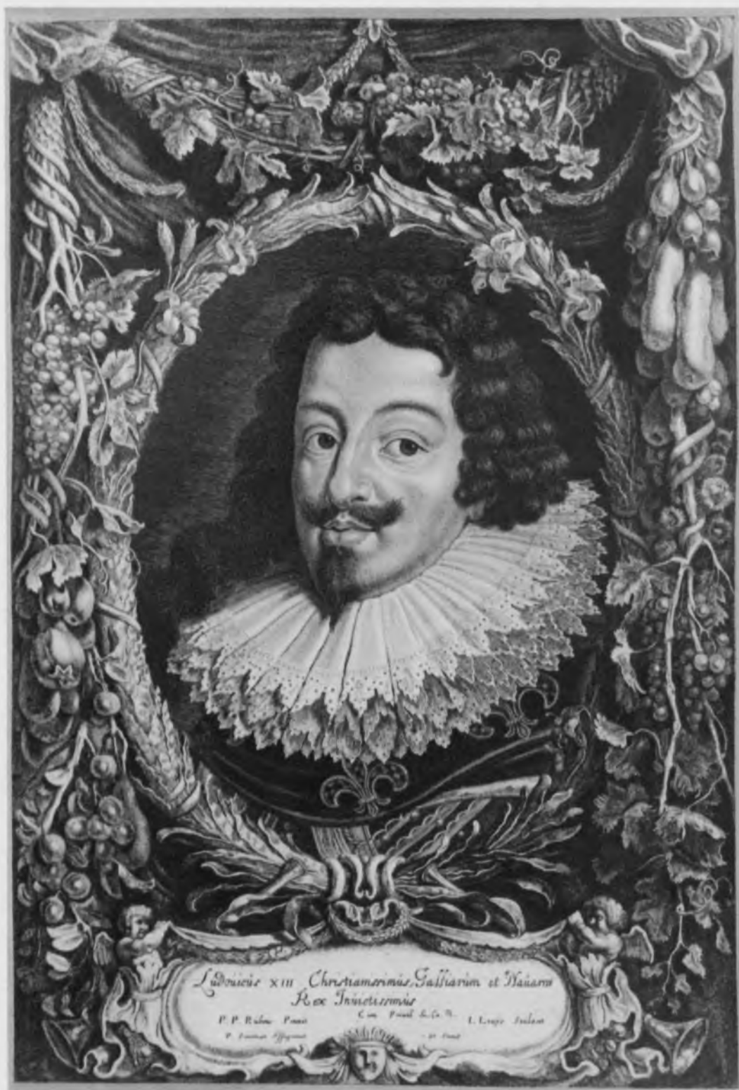
74. J. Louys, Louis XIII, King of France , engraving (No. 21)