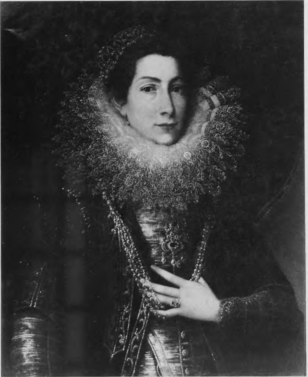
136. Rubens, A Lady (No. 52). Whereabouts unknown