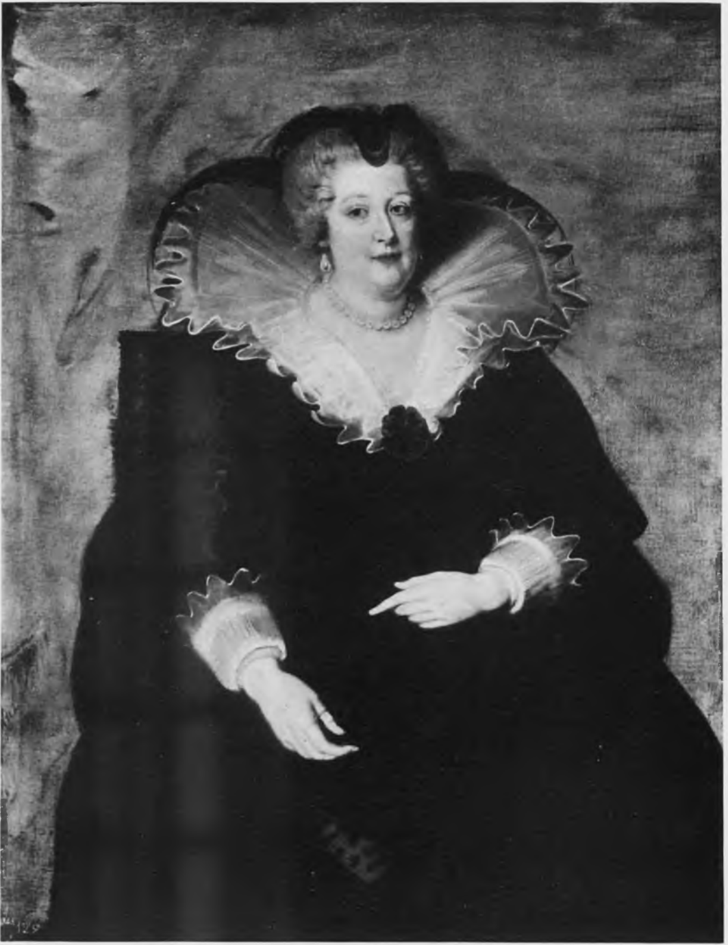
83. Rubens, Maria de' Medici, Queen Mother of France (No. 27). Madrid, Prado