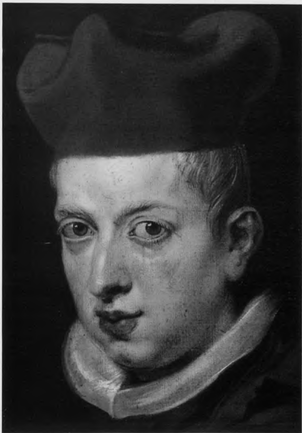
60. Detail of Fig. 61