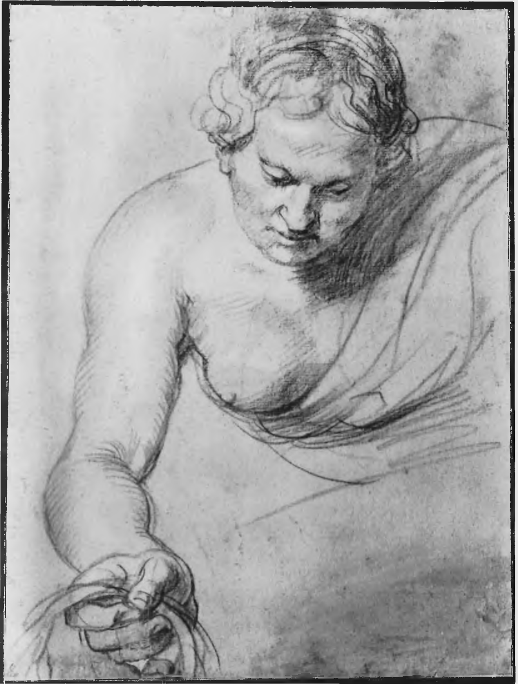
87. Rubens, Woman with Laurel Wreath , drawing (No. 30a). Vienna, Albertina