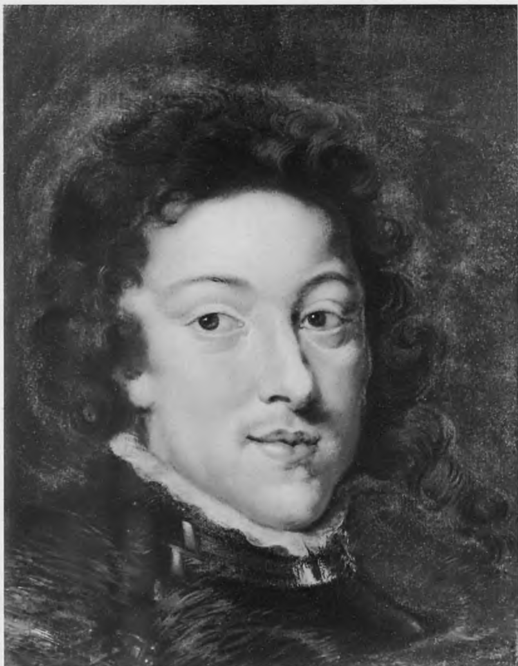
77. Rubens, Louis XIII, King of France , oil sketch (No. 21a).