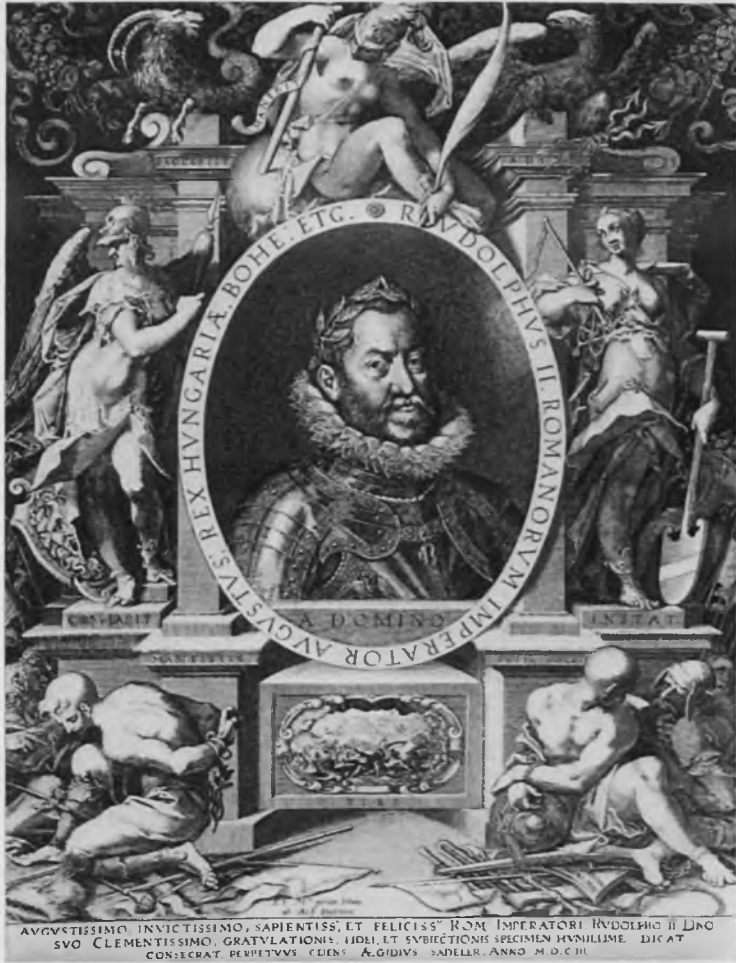
13. G. Sadeler, Rudolf II, German Emperor , engraving