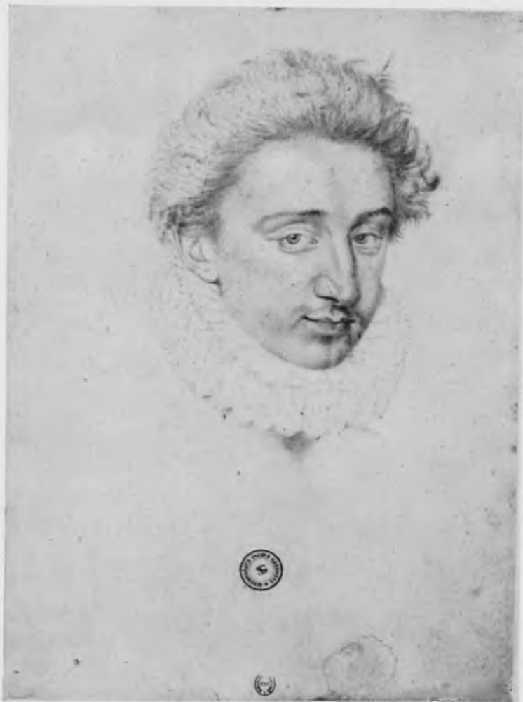
17. F. Clouet, Henri IV, King of Navarre , drawing. Paris, Bibliothèque Nationale