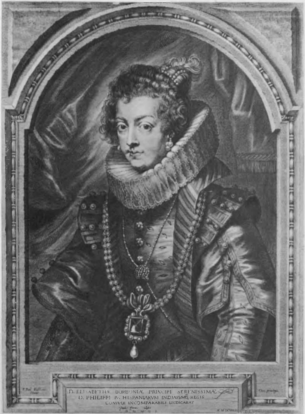
104. P. Pontius, Isabella of Bourbon, Queen of Spain , engraving (No. 34b)