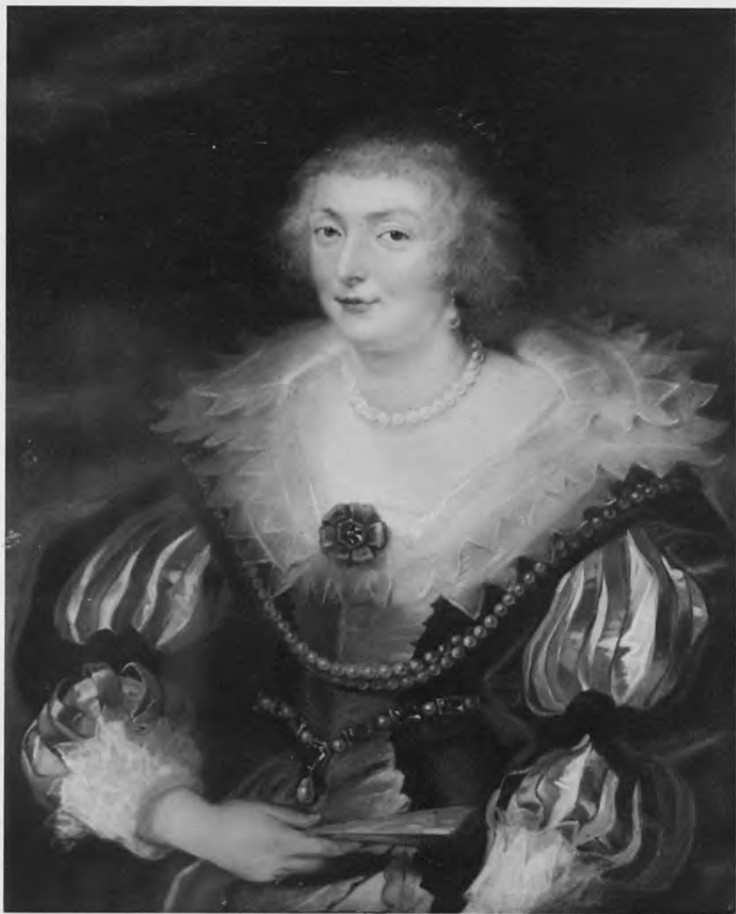
57. Rubens, Catherine Manners, Duchess of Buckingham (?) (No. 6). Dulwich, College Picture Gallery