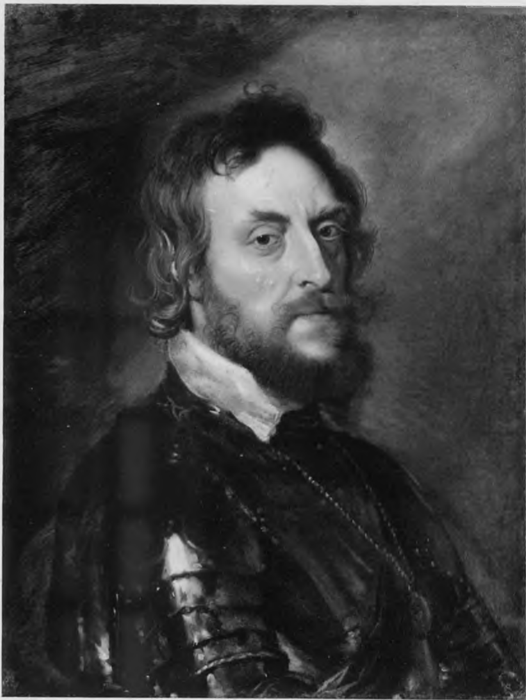
53. Rubens, Thomas Howard, Earl of Arundel , oil sketch (No. 5b).