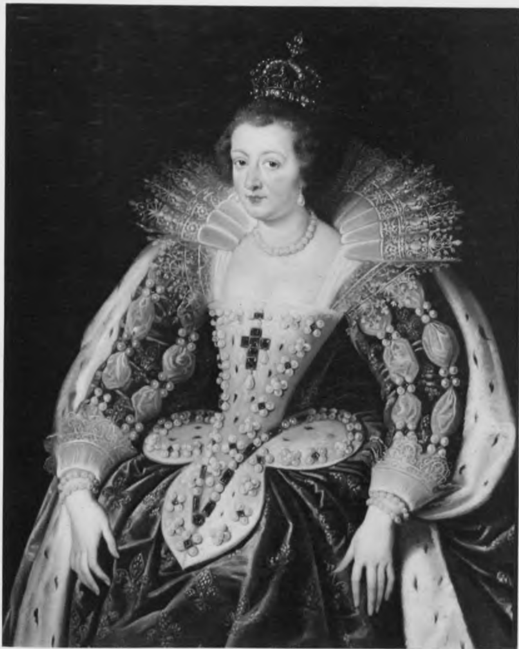
72. Rubens, Anne of Austria, Queen of France (No. 22).

Los Angeles, The Norton Simon Foundation