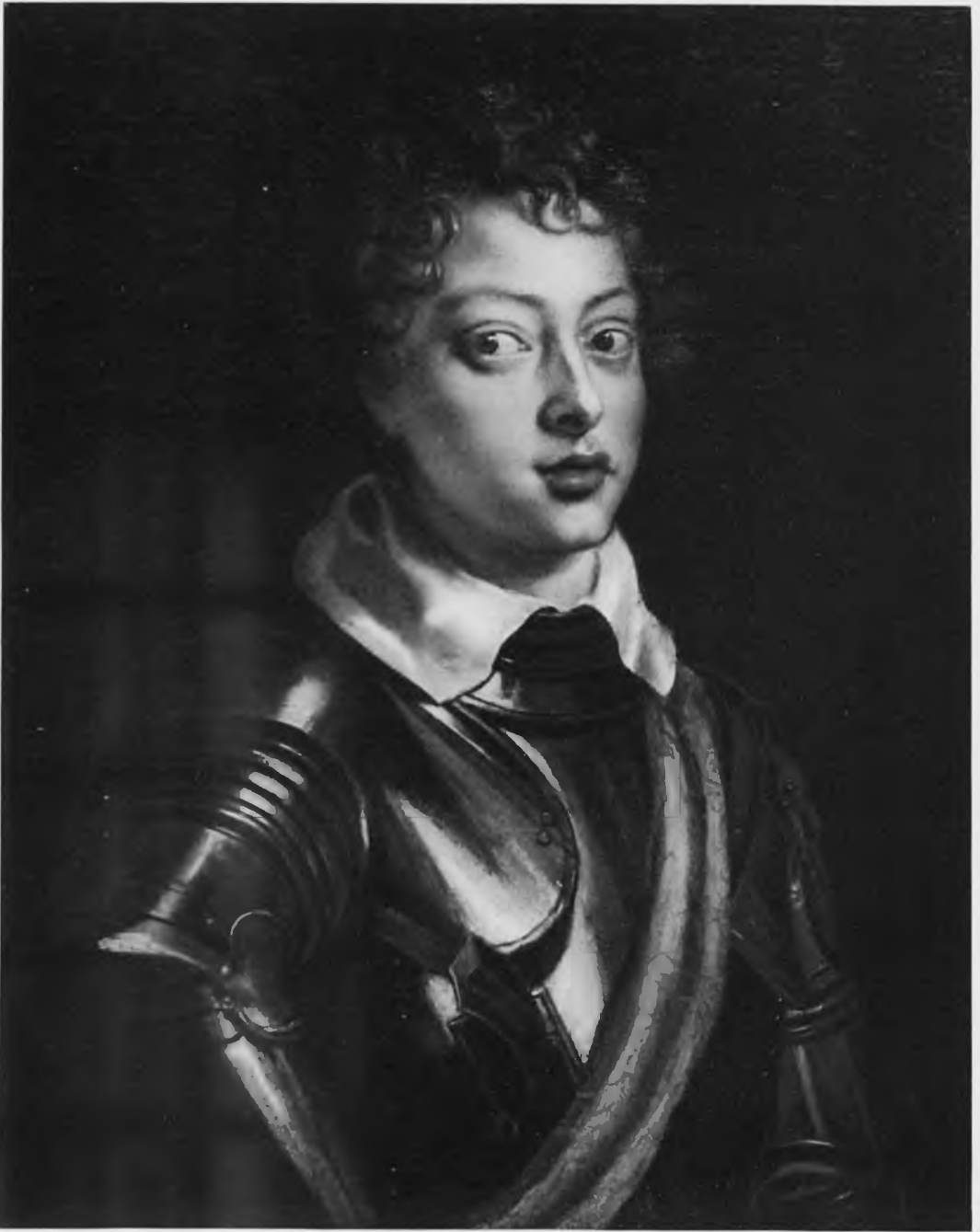
65. Rubens, Francesco Gonzaga (?) (No. 15). Plympton, Saltram House