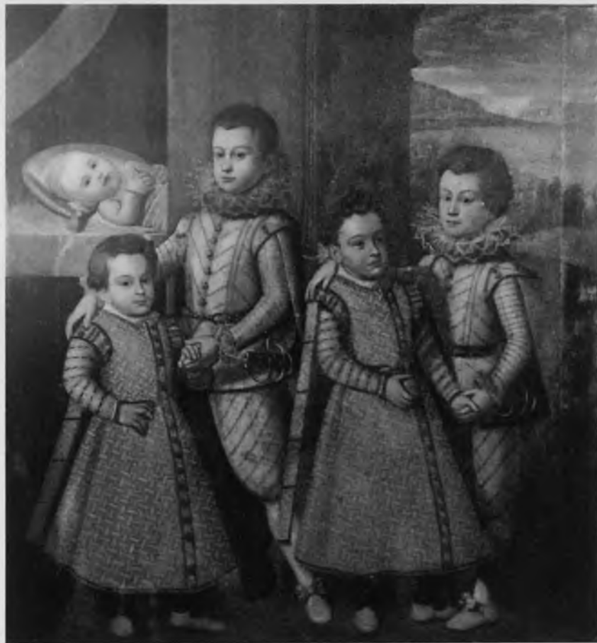
7. ? S. Pulzone, The Gonzaga Family . Present whereabouts unknown