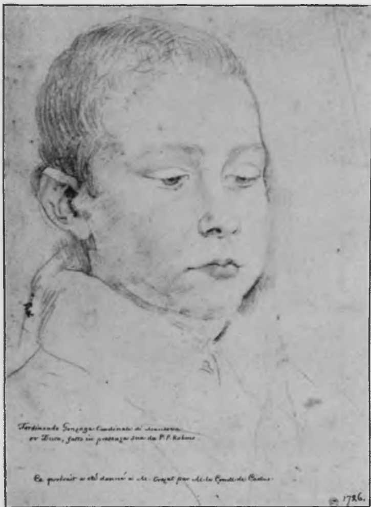
4. Rubens, Ferdinando Gonzaga , drawing. Stockholm, Nationalmuseum