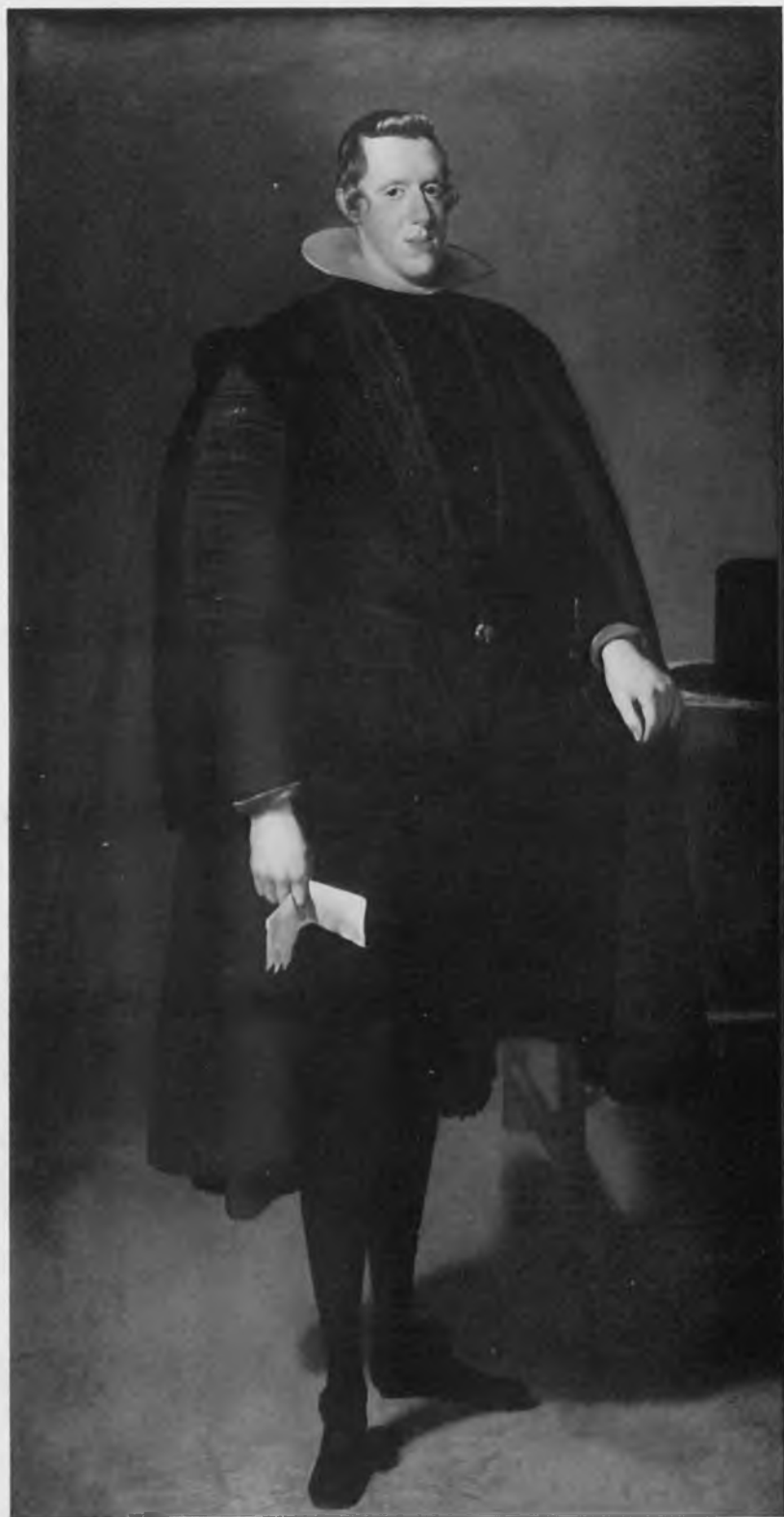
93. Velázquez, Philip IV, King of Spain . Madrid, Prado