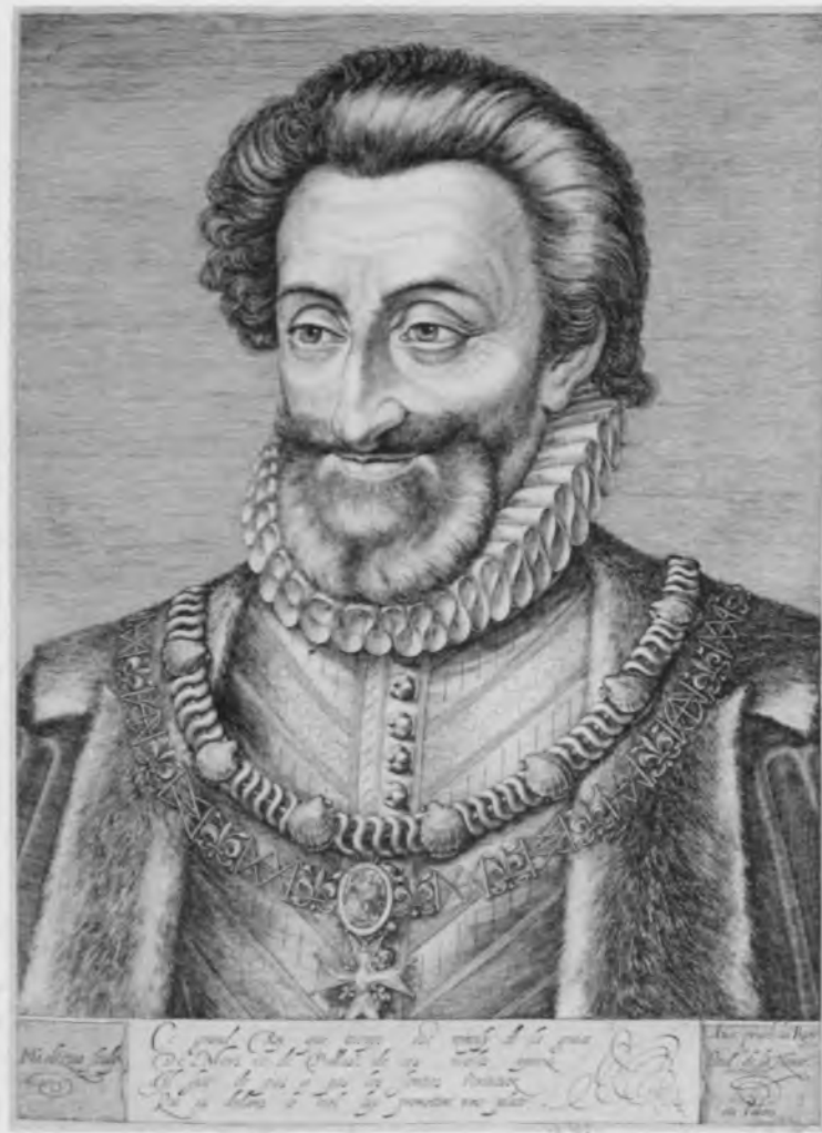
20. H. Goltzius, Henri IV, King of France , engraving