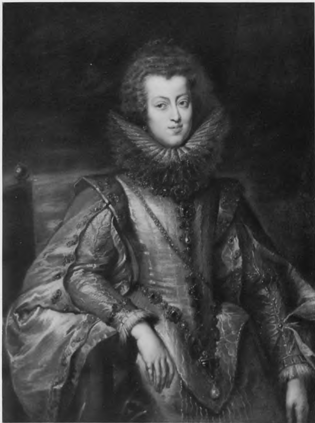
79. Rubens, Maria, Infante of Spain, later Queen of Hungary and Bohemia (No. 24).