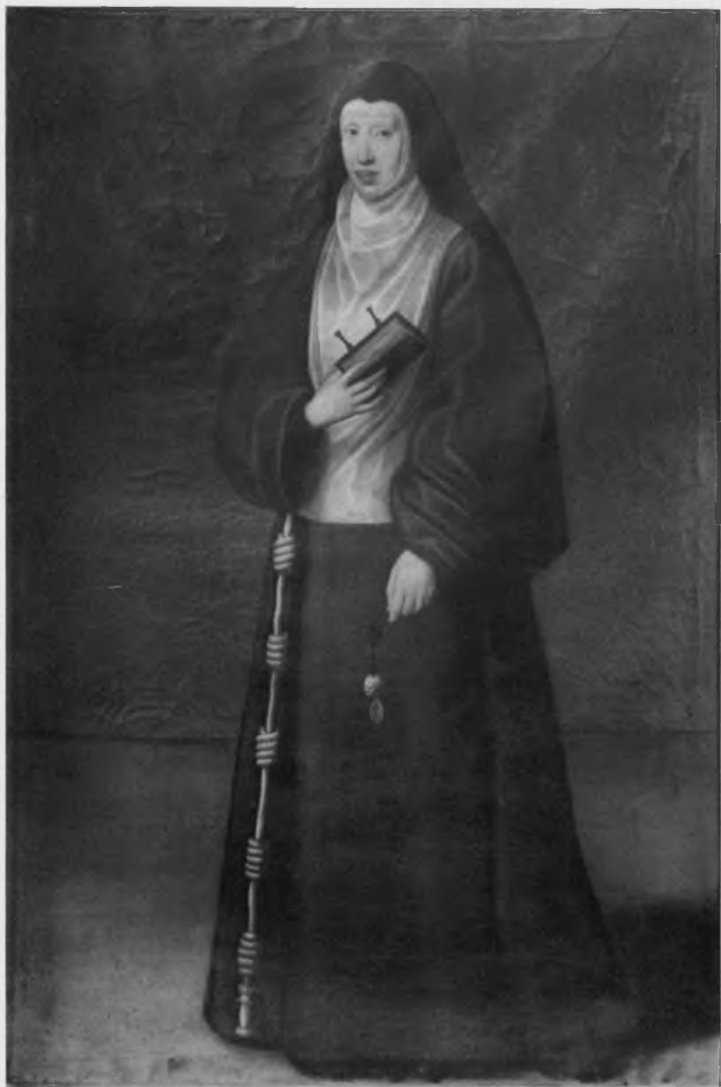
82. After Rubens, Sor Margarita de la Cruz (No. 23). Madrid, Descalzas Reales