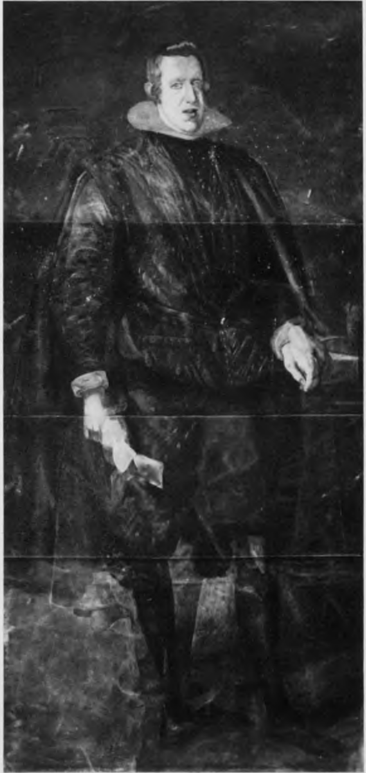
94. X-radiograph of Fig. 93