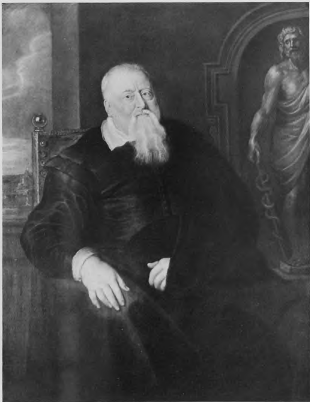
128. Rubens, Théodore Turquet de Mayerne (No. 47). Raleigh, North Carolina Museum of Art