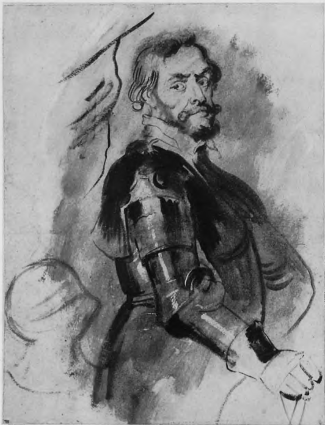
51. Rubens, Thomas Howard, Earl of Arundel , drawing (No. 5a). Williamstown, The Sterling and Francine Clark Art Institute