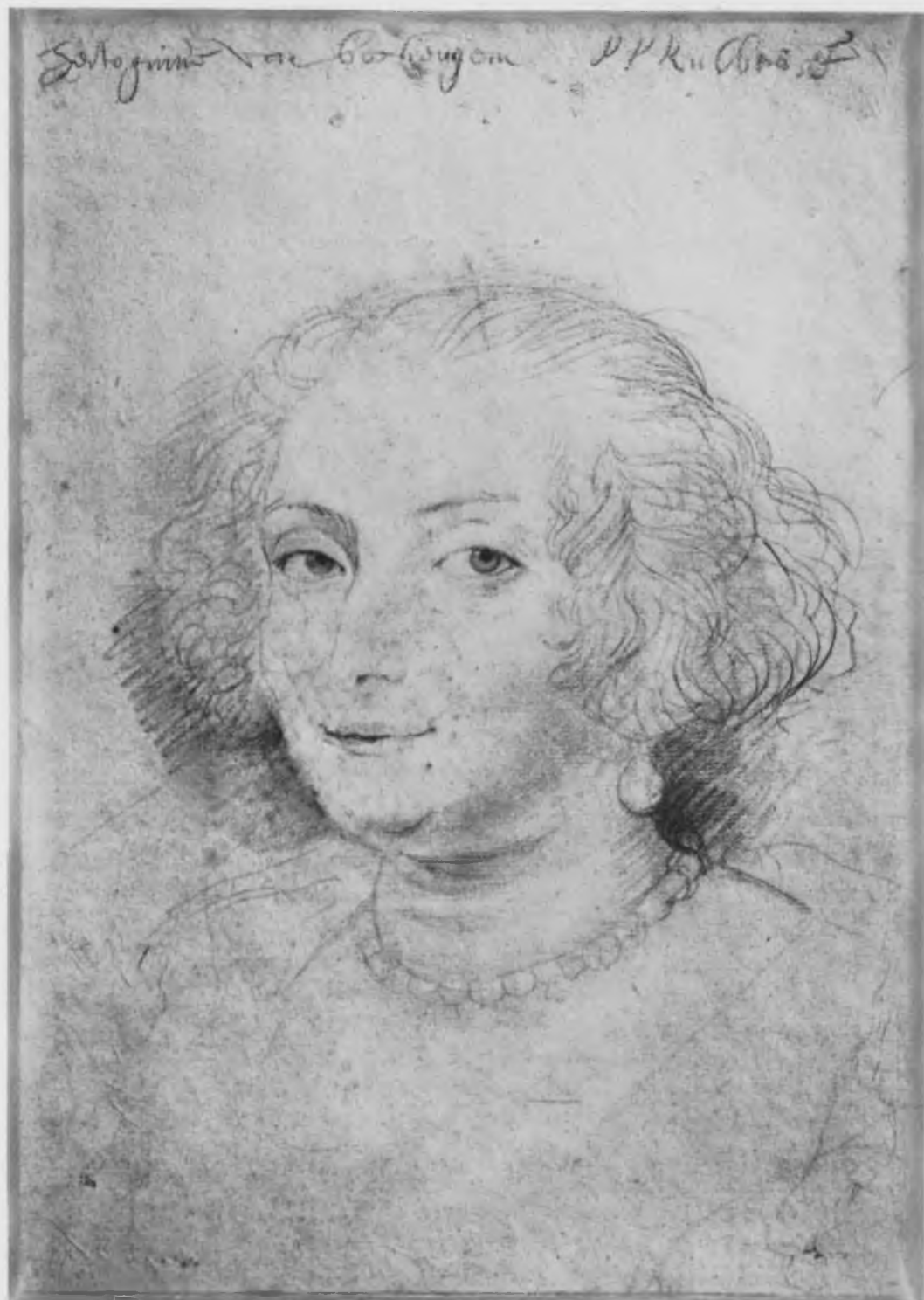
58. Rubens, Catherine Manners, Duchess of Buckingham (?) , drawing (No. 6a). Vienna, Albertina