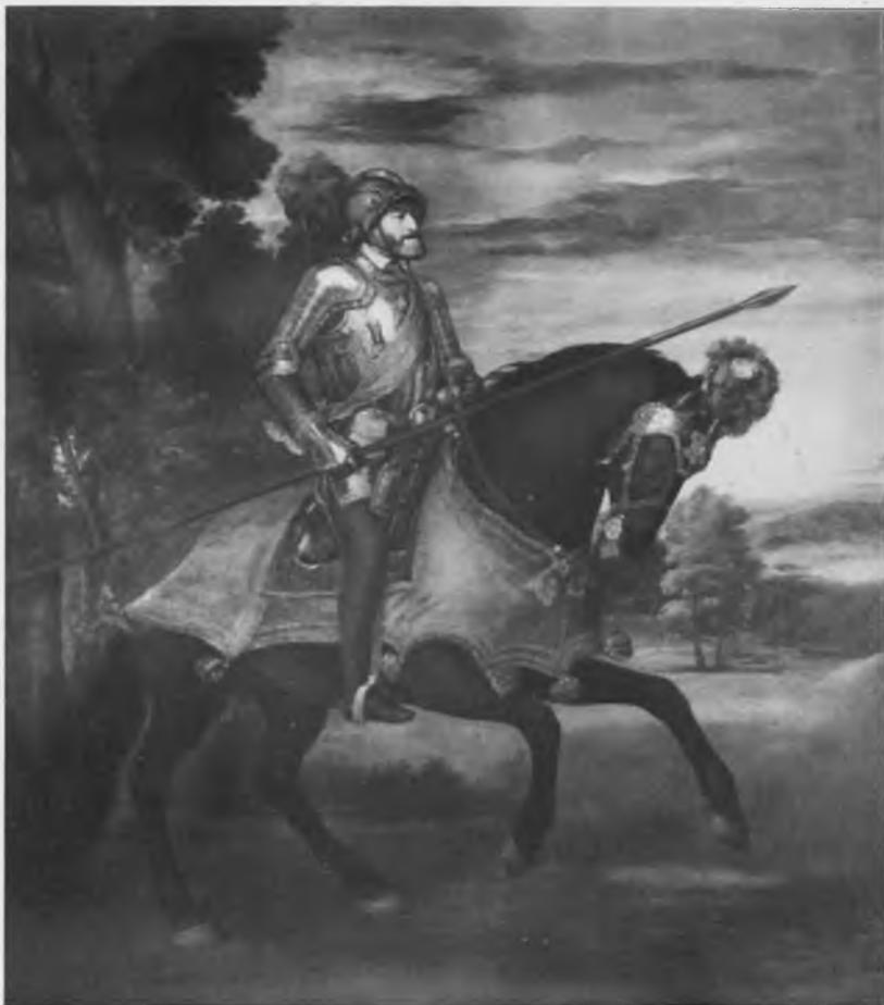
89. Titian, Charles V on Horseback . Madrid, Prado