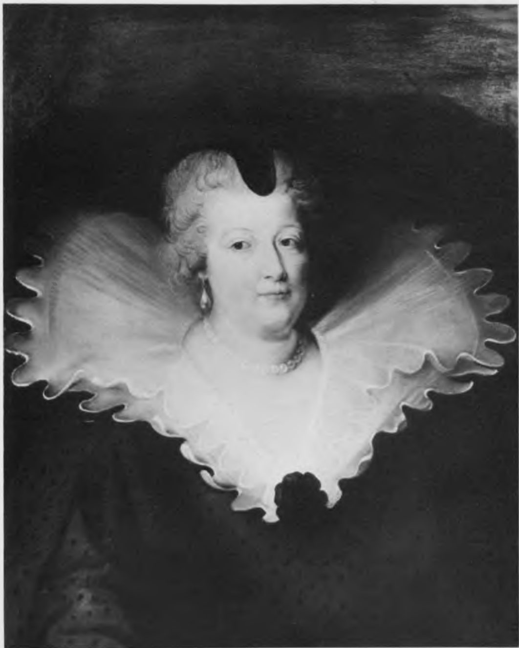
84. ? Rubens, Maria de' Medici, Queen Mother of France (No. 28). Paris, Galerie Pardo