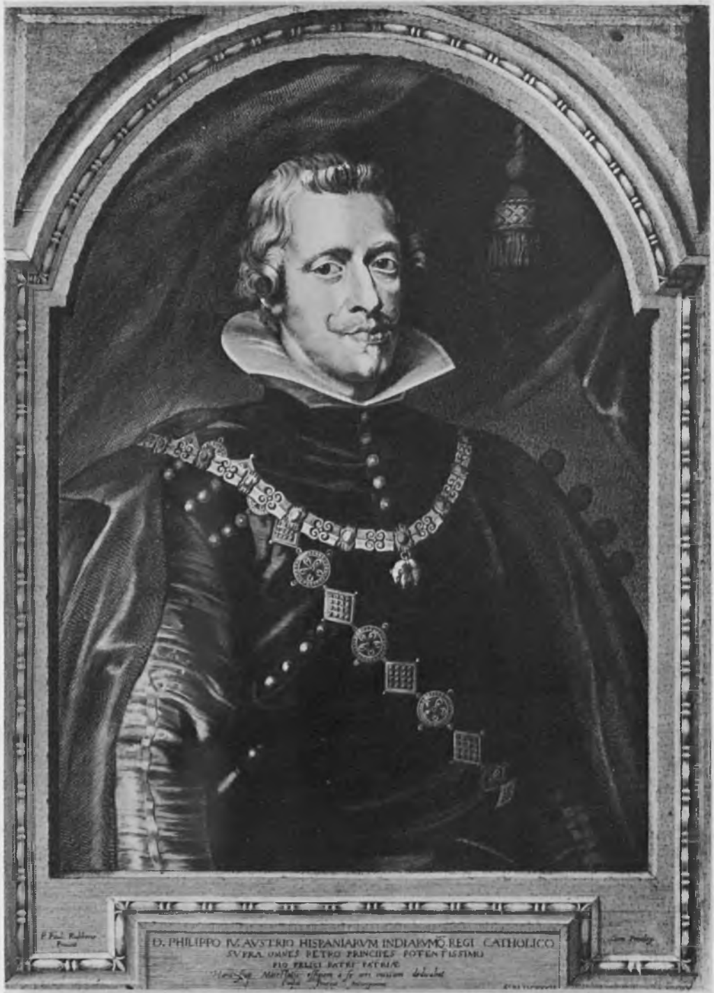
103. P. Pontius, Philip IV, King of Spain , engraving (No. 33a)