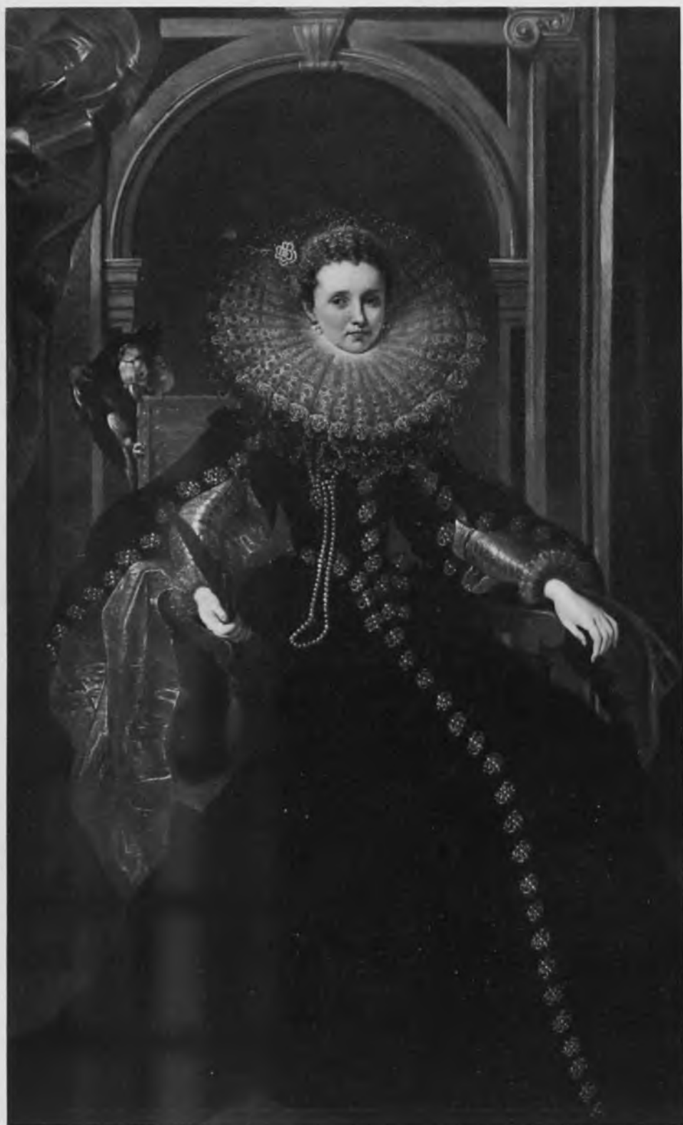
124. Rubens, Veronica Spinola Doria (No. 43). Karlsruhe, Staatliche Kunsthalle