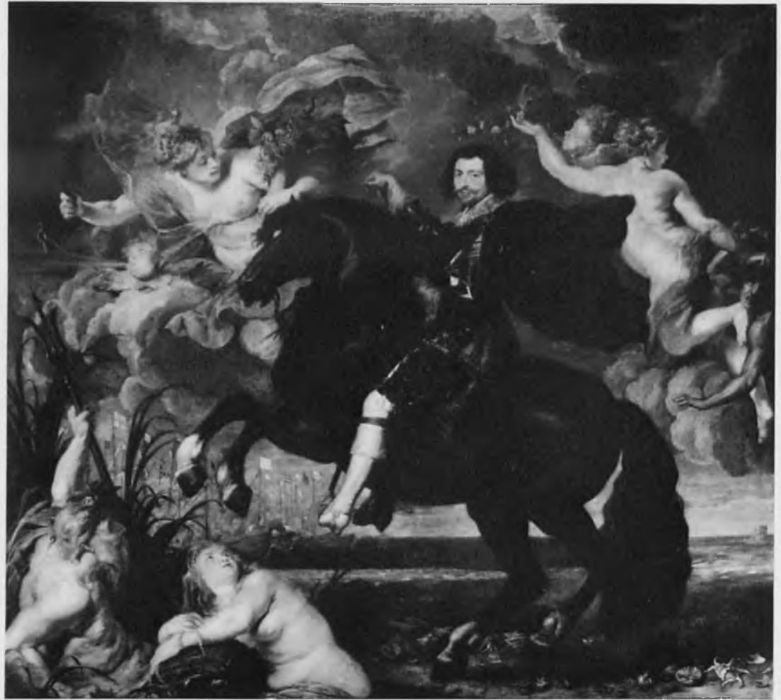
32. Rubens, George Villiers, Duke of Buckingham on Horseback .

Formely Oſterley Park, The Earl of Jerſey, now loſt