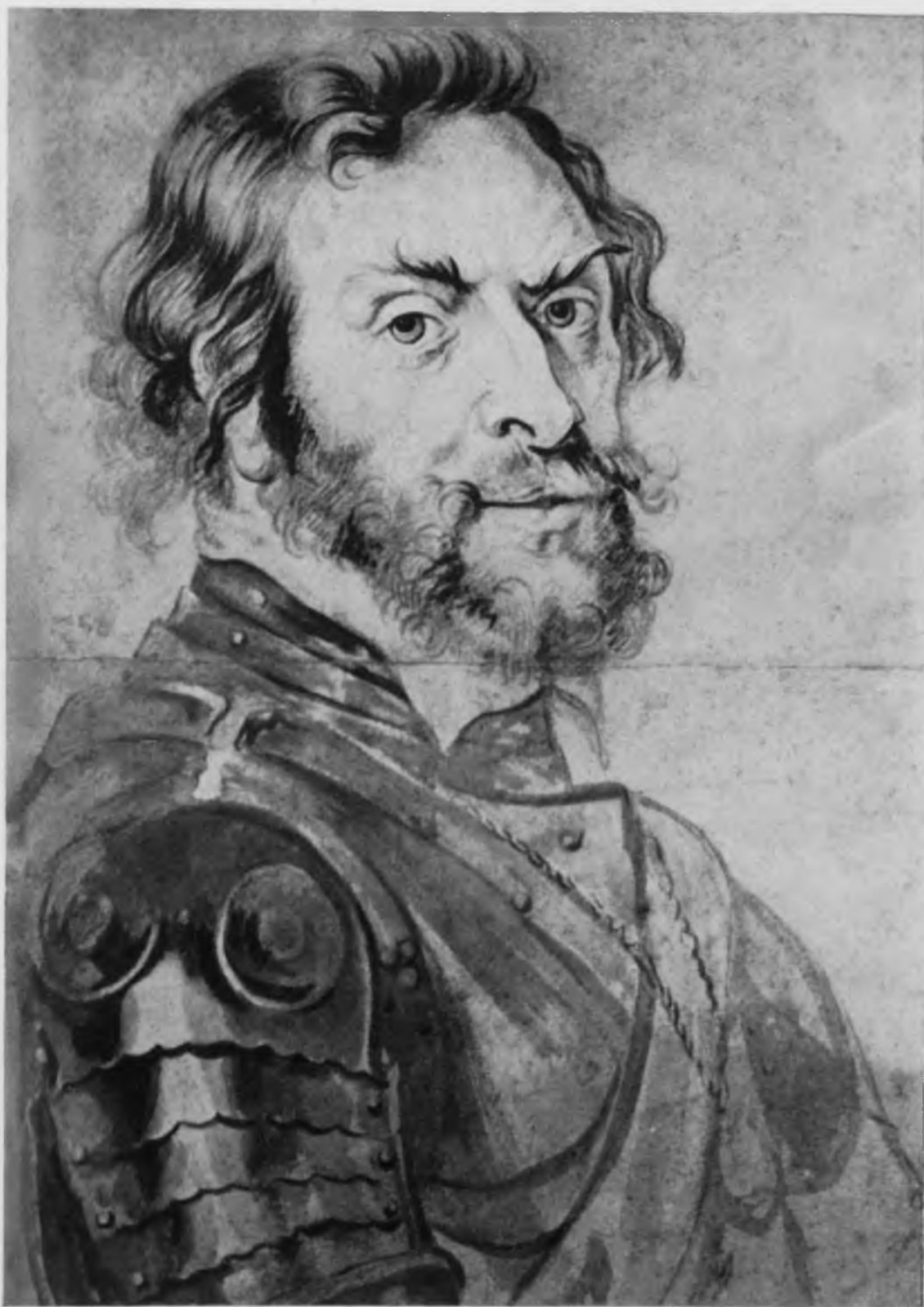
54. After Rubens, Thomas Howard, Earl of Arundel , drawing (No. 5b). Weimar, Schlossmuseum