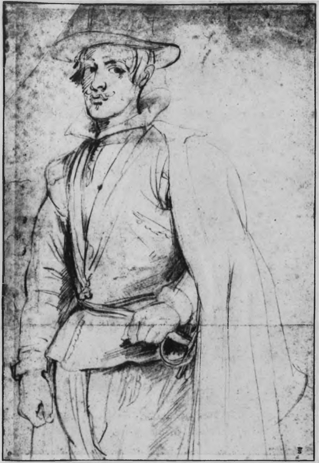
88. Rubens, Philip IV, King of Spain , drawing (No. 32). Bayonne, Musée Bonnat