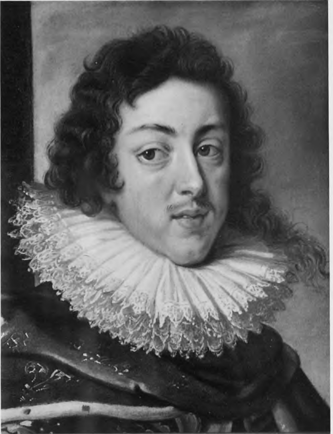
75. Detail of Fig. 71