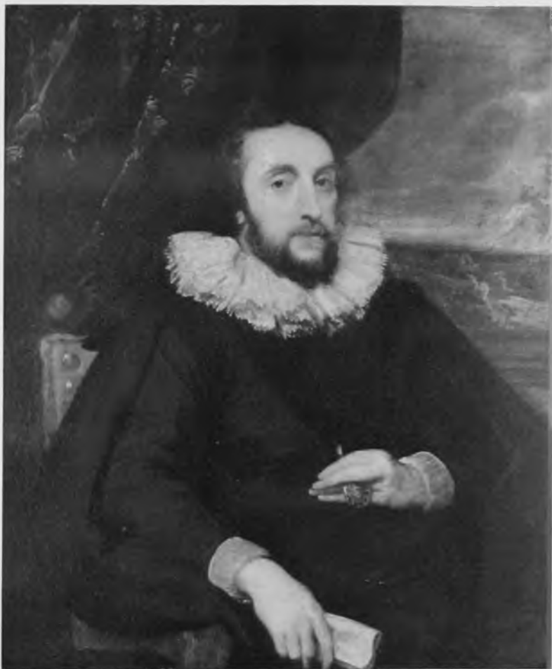
37. A. van Dyck, Thomas Howard, Earl of Arundel . New York, Private Collection