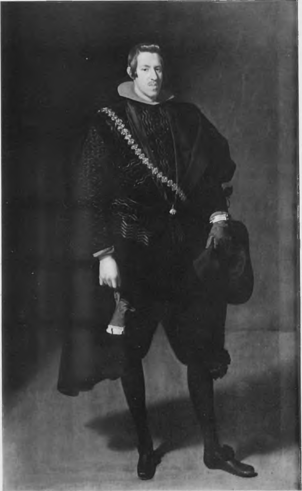
95. Velázquez, Philip IV, King of Spain . Madrid, Prado