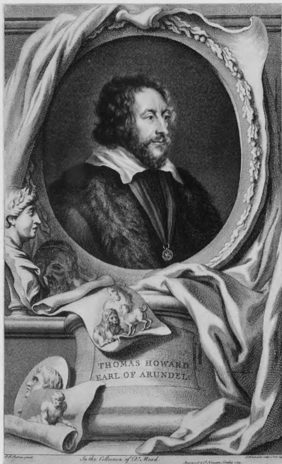
47. J. Houbraken, Thomas Howard, Earl of Arundel , engraving (No. 4)