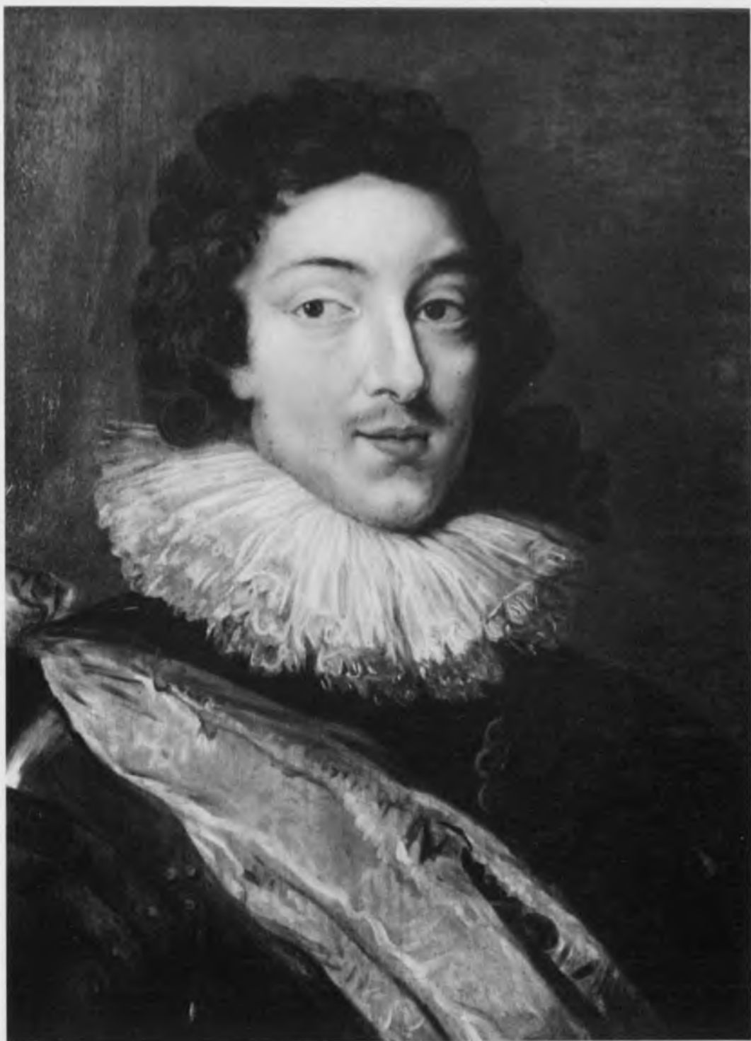
78. After Rubens, Louis XIII, King of France (No. 21a). Dessau, Gemäldegalerie