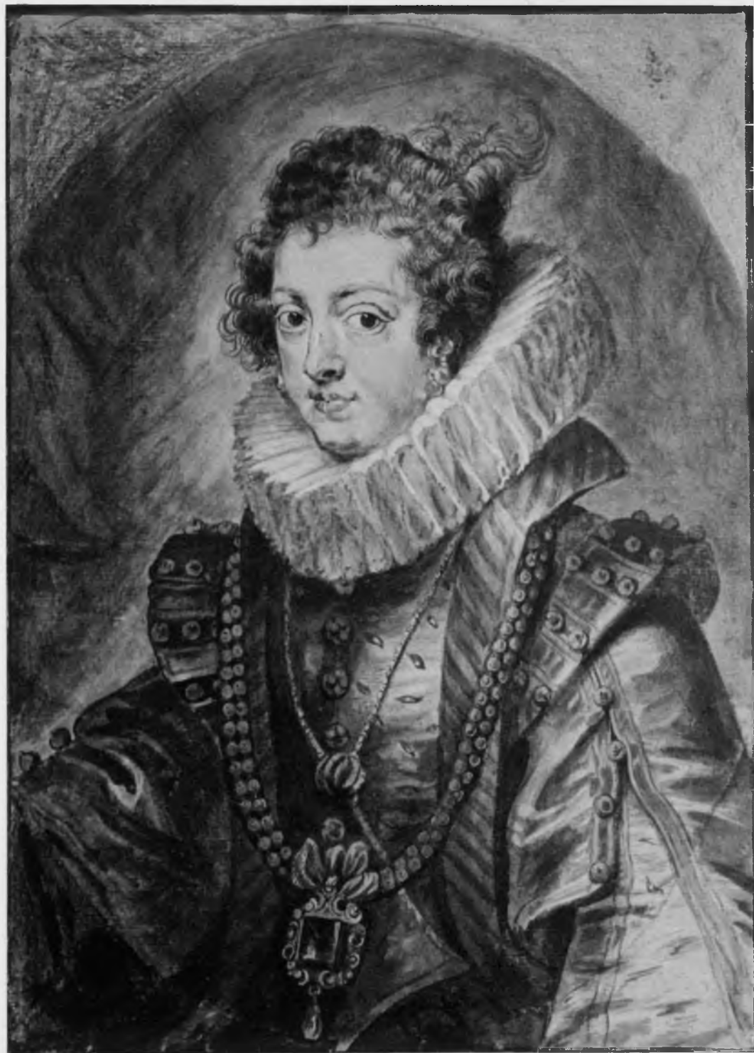
102. P. Pontius, retouched by Rubens, Isabella of Bourbon, Queen of Spain , drawing (No. 34b). Vienna, Albertina