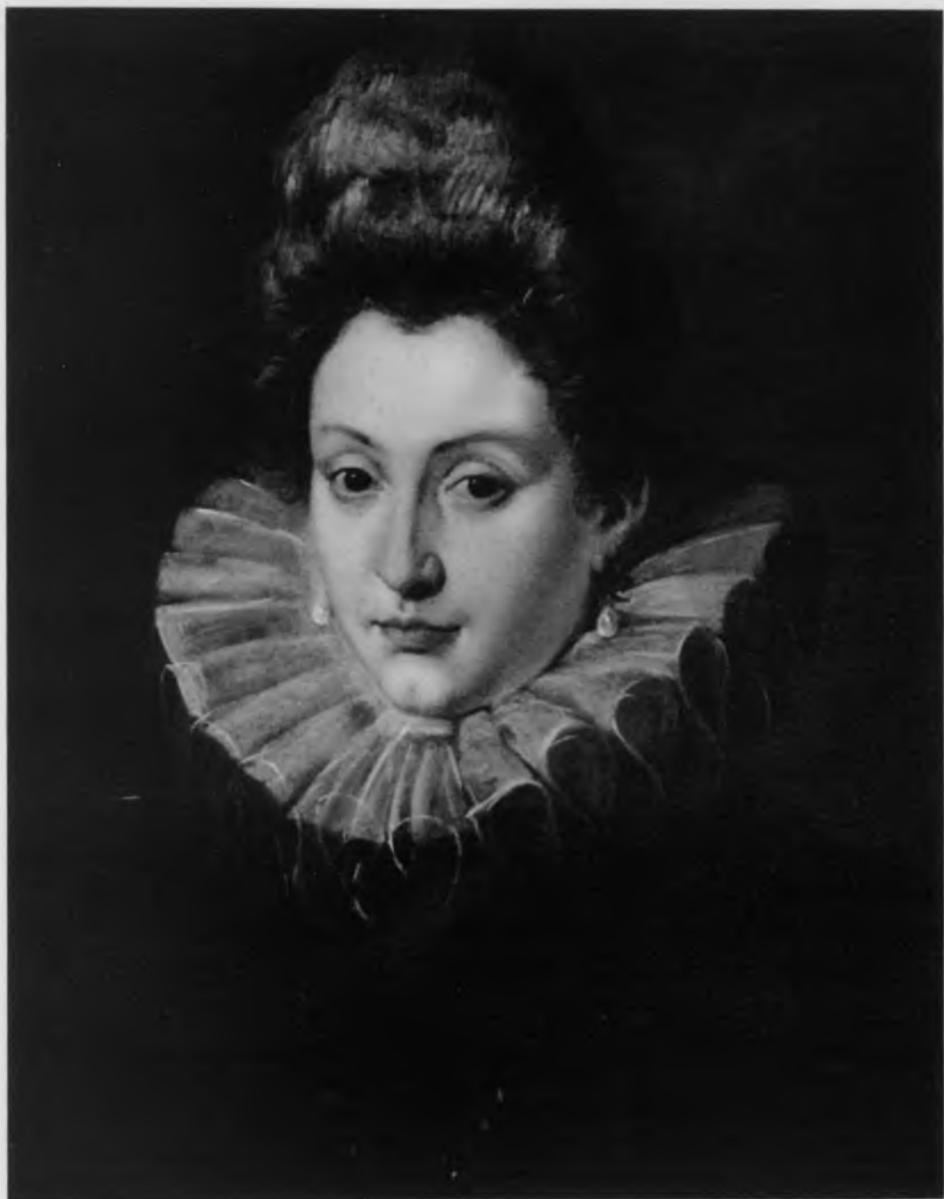
135. ? Rubens, A Lady (No. 55). Whereabouts unknown