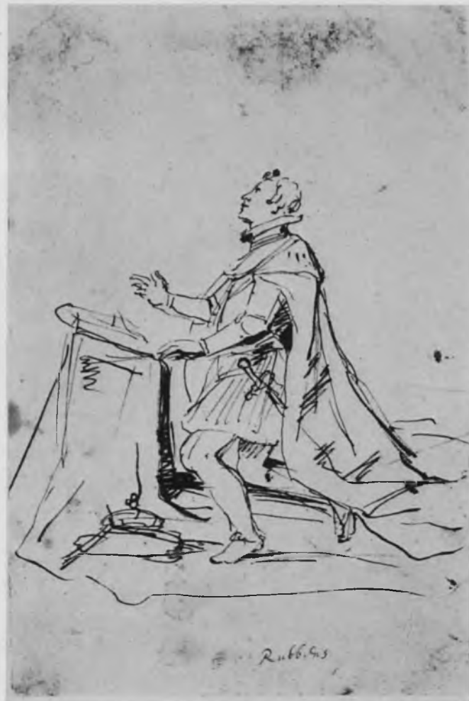
3. Rubens, A Prince Kneeling before a Prie-Dieu , drawing. Amsterdam, Rijksprentenkabinet