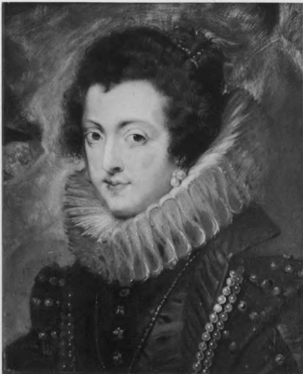
108. Rubens, Isabella of Bourbon, Queen of Spain , oil sketch (No. 34a).