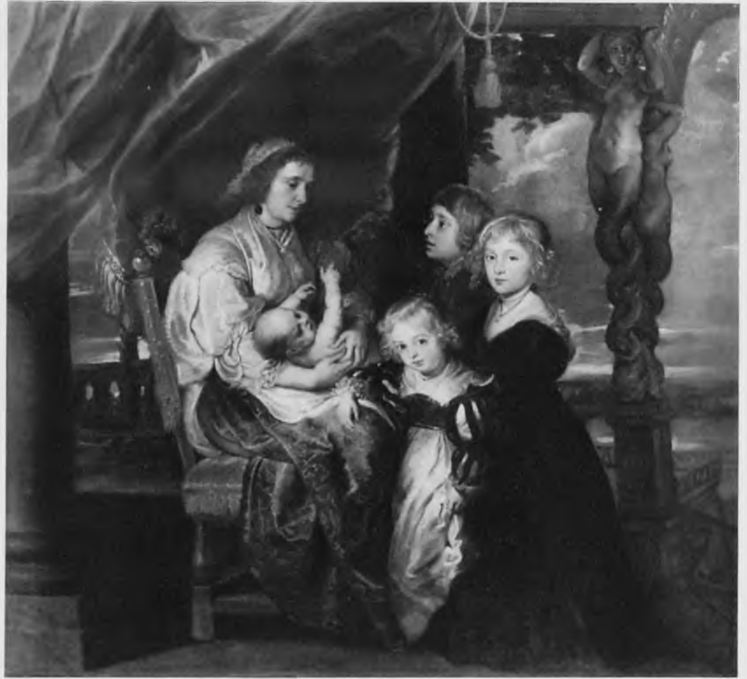
63. After Rubens, The Family of Sir Balthasar Gerbier (No. 14).