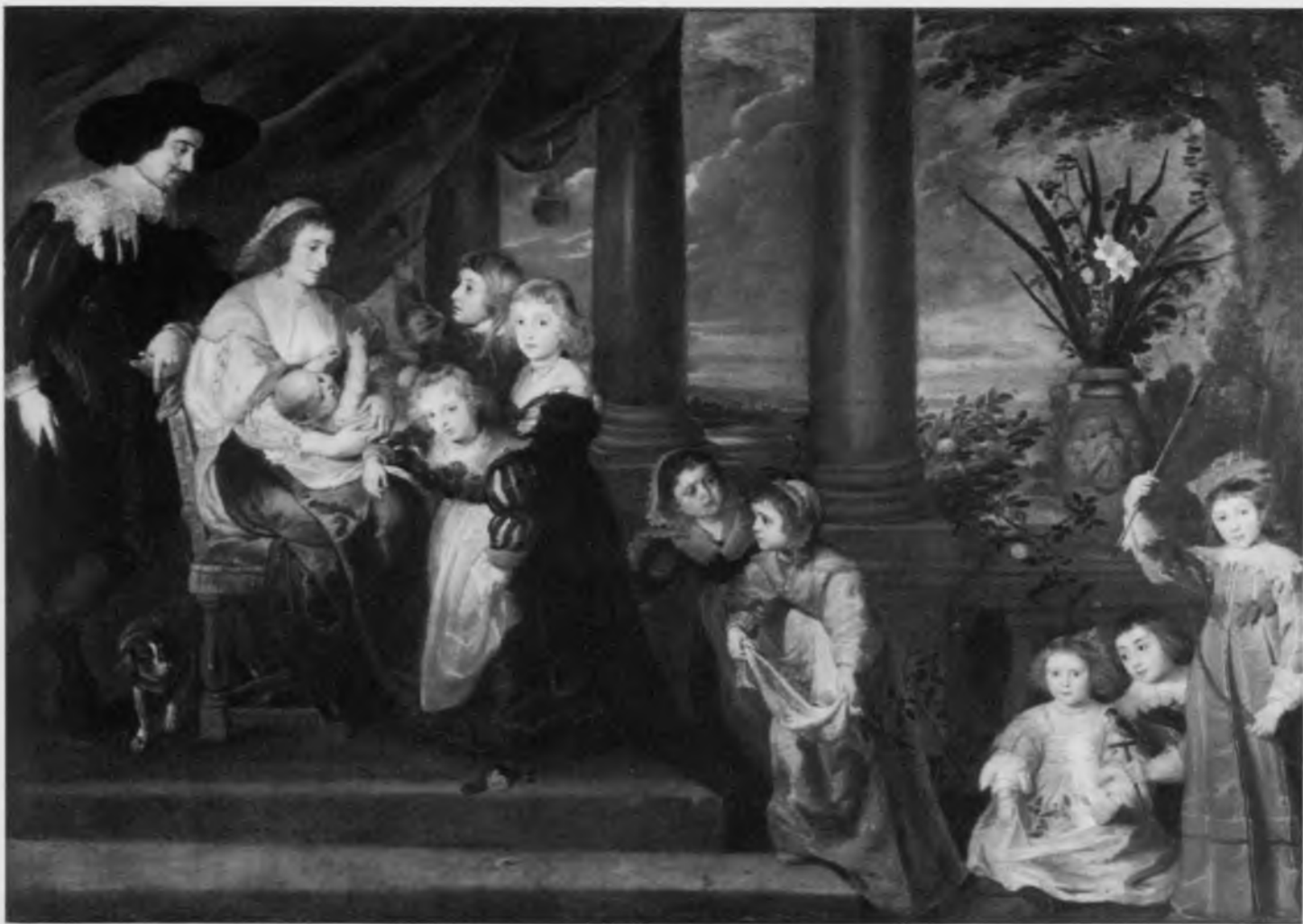
64. After Rubens, The Family of Sir Balhasar Gerbier (No. 14). Windsor Castle, Royal Collection