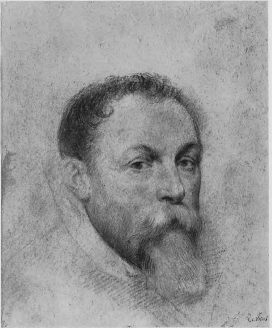
130. Rubens, Bearded Man , drawing (No. 50). Vienna, Albertina