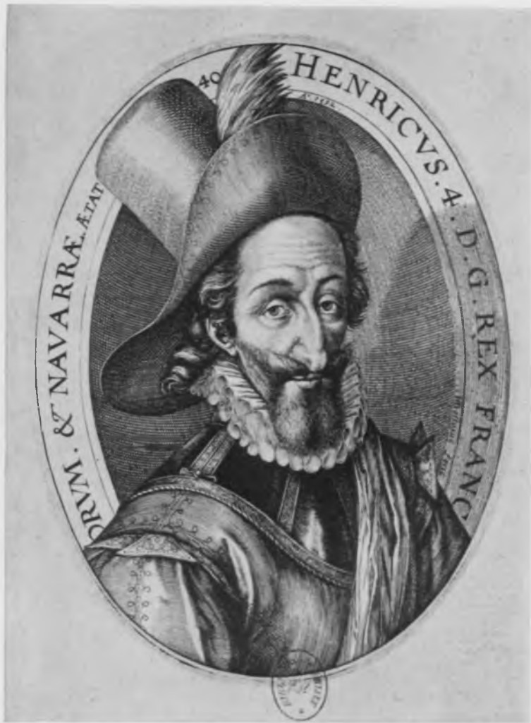
19. H. Goltzius, Henri IV, King of France , engraving