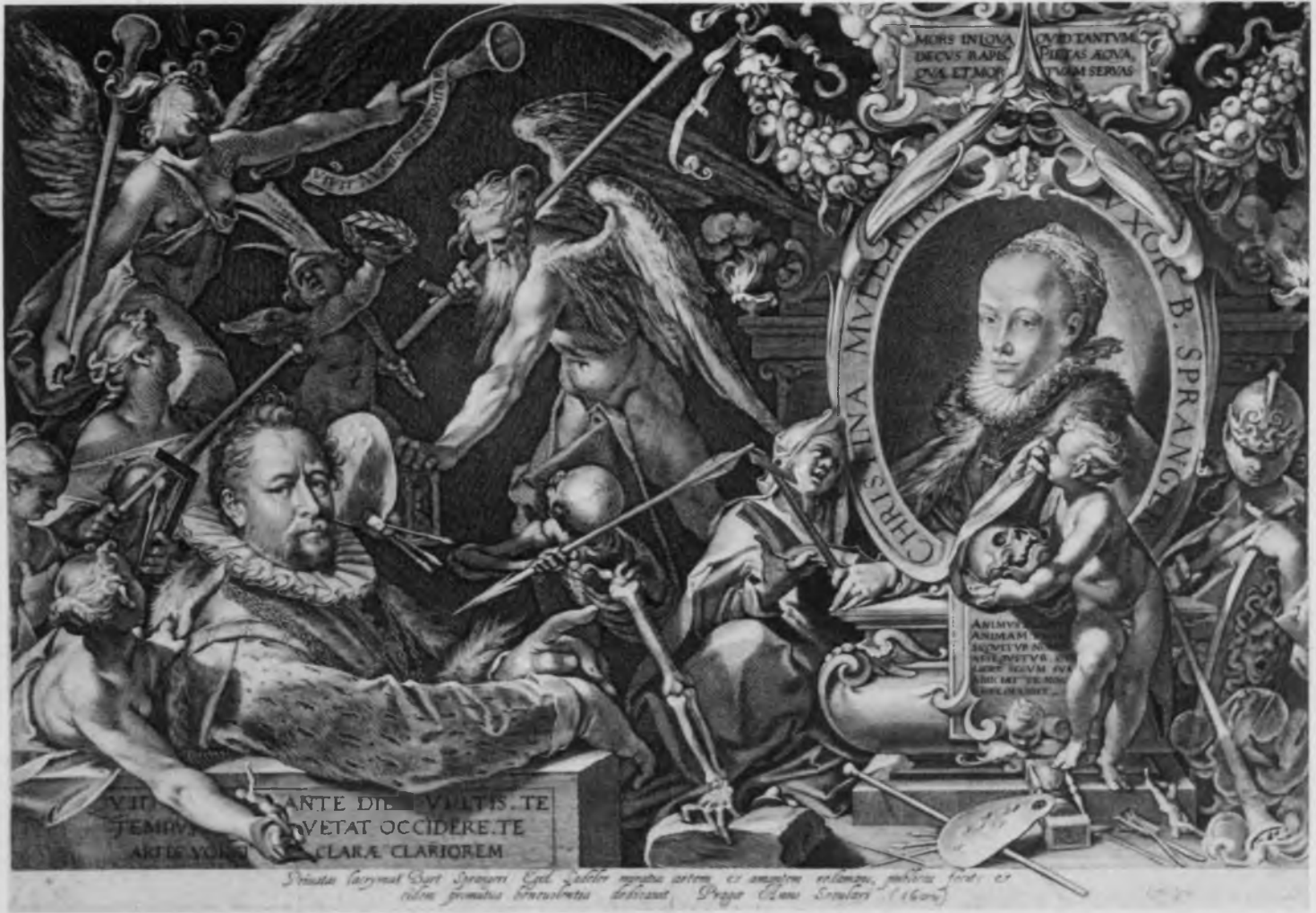
8. G. Sadeler, Bartholomeus Spranger and his Wife , engraving