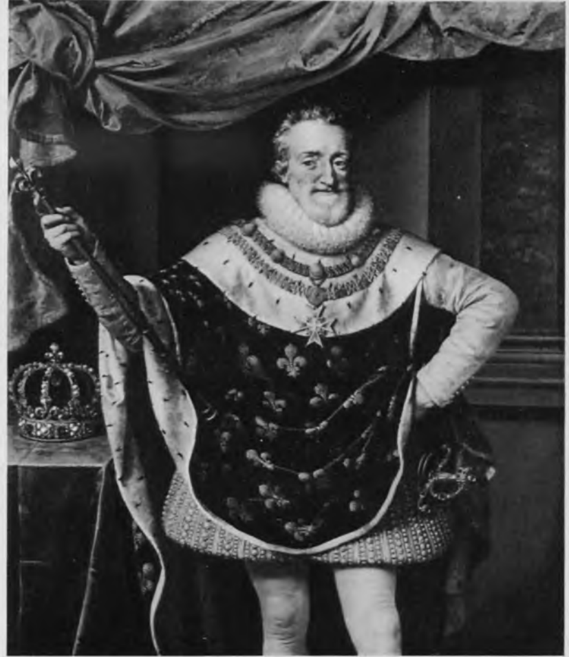
14. F. Pourbus the Younger, Henri IV, King of France . Florence, Uffizi