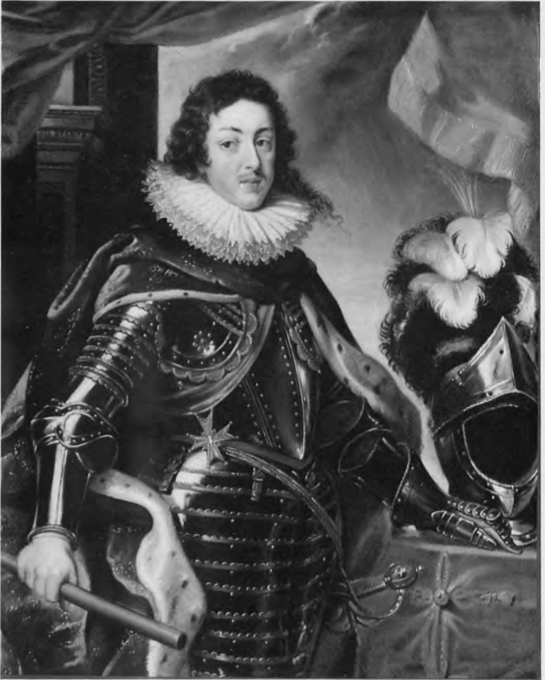
71. Rubens, Louis XIII, King of France (No. 21). Los Angeles, The Norton Simon Foundation