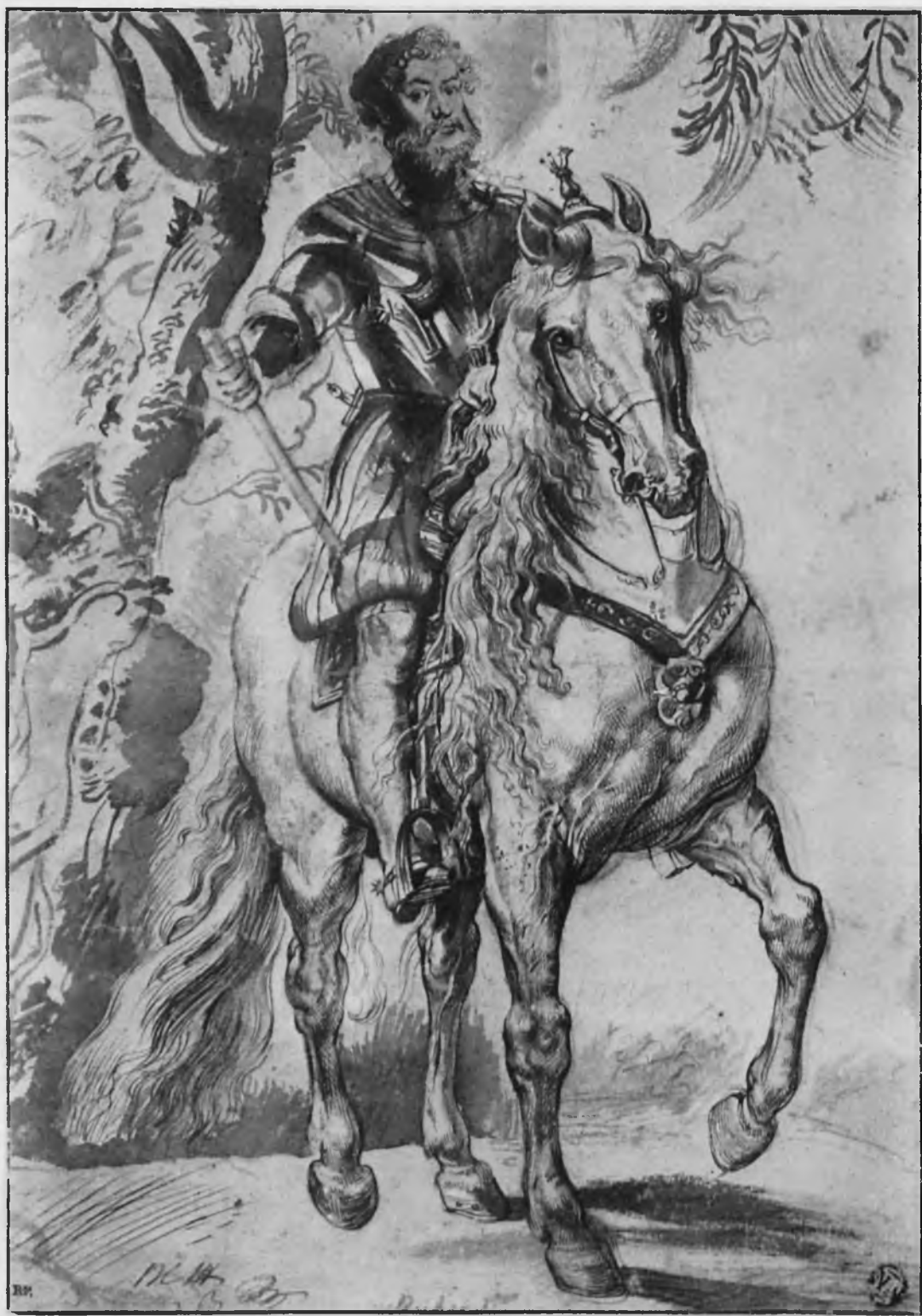
69. Rubens, A Rider on Horseback , drawing (No. 20a).

Paris, Cabinet des Dessins du Musée du Louvre