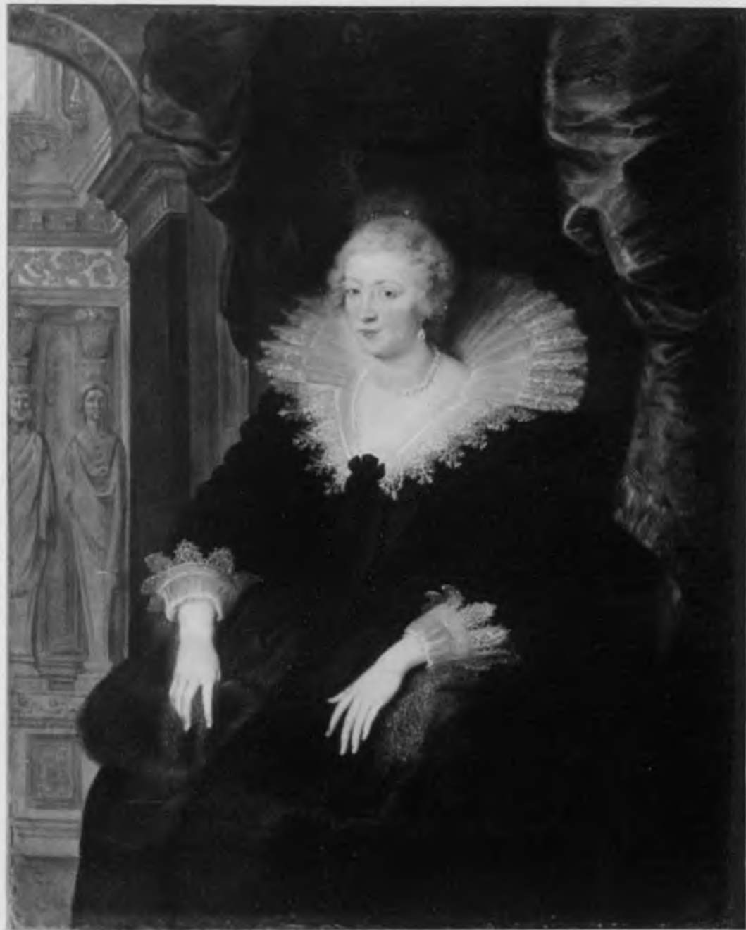
44. After Rubens, Anne of Austria, Queen of France (No. 2).