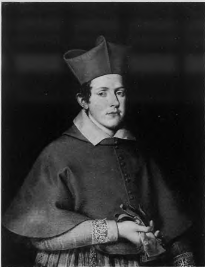
6. ? F. Pourbus the Younger, Ferdinando Gonzaga as Cardinal . Bologna, Pinacoteca Nazionale