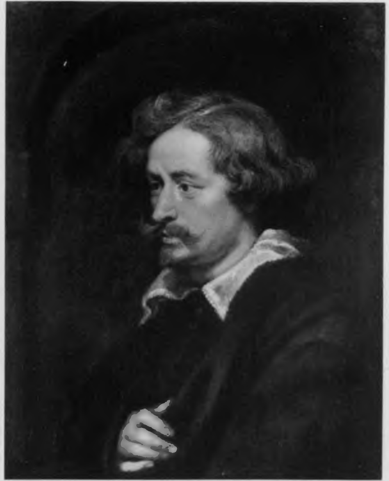
40. Rubens, Anthony Van Dyck . Windsor Castle, Royal Collection