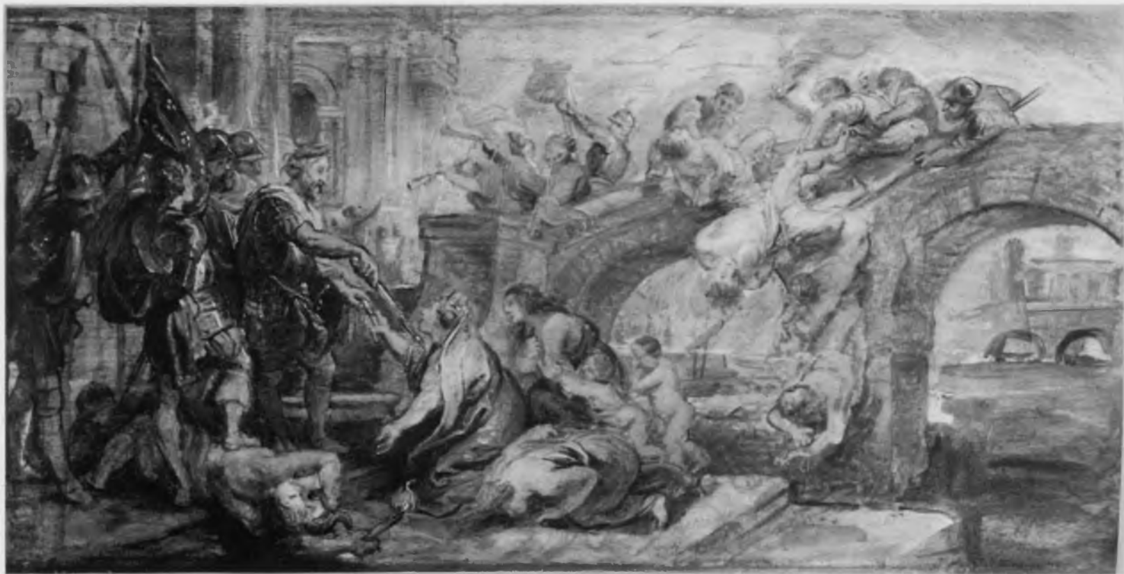
22. Rubens, The Surrender of Paris , oil sketch. Berlin-Dahlem, Staatliche Museen