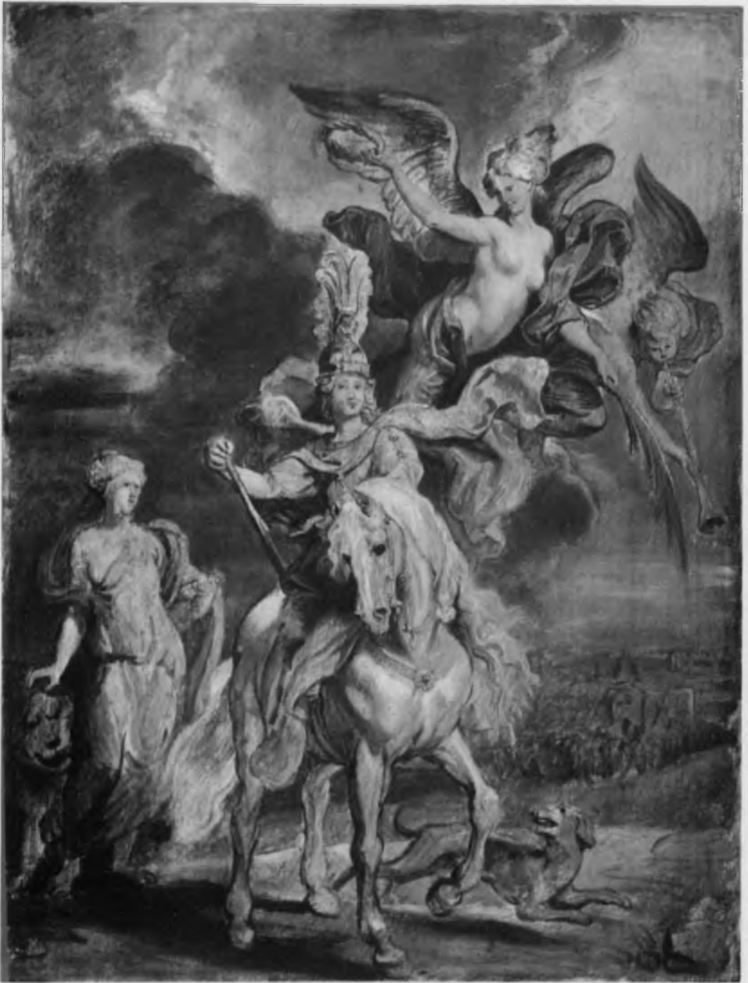
27. Rubens, The Triumph of Jülich , oil sketch. Munich, Alte Pinakothek