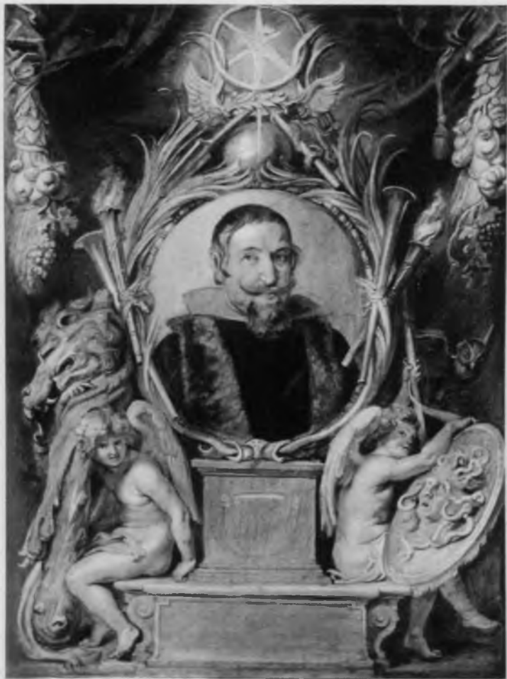
11. P. Pontius, Don Gaspar de Guzman, Count of Olivares and Duke of Sanlúcar , engraving