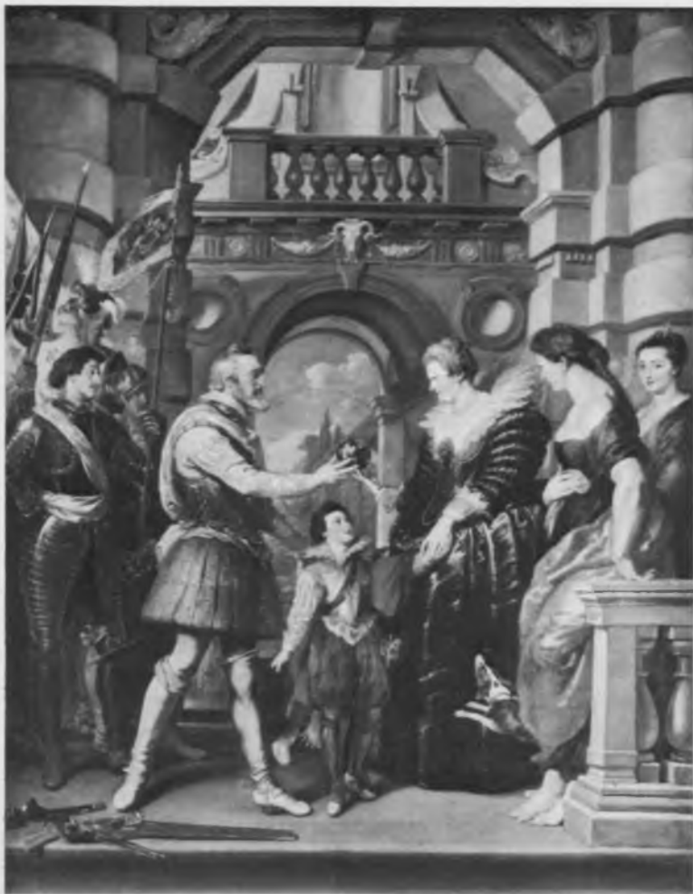
15. Rubens, Henri IV Giving over the Realm to Maria de' Medici . Paris, Louvre