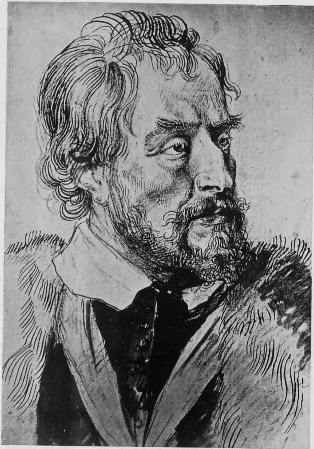
49. Rubens, Thomas Howard, Earl of Arundel , drawing (No. 4a). Whereabouts unknown