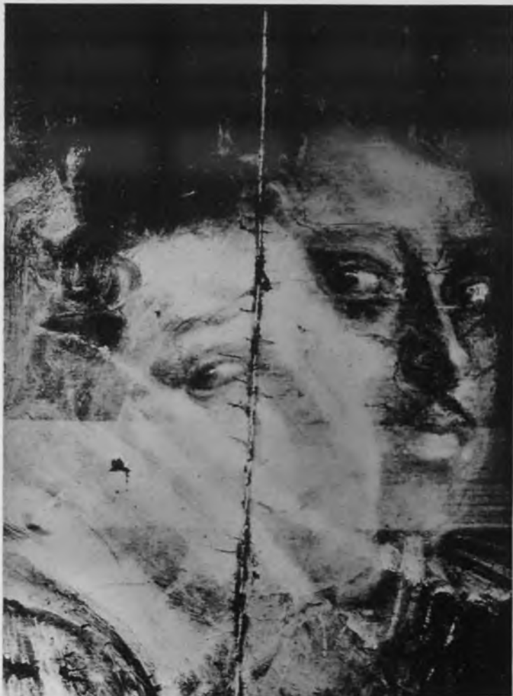
2. Rubens, Francesco Gonzaga , X-radiograph of detail. Vienna, Kunsthistorisches Museum