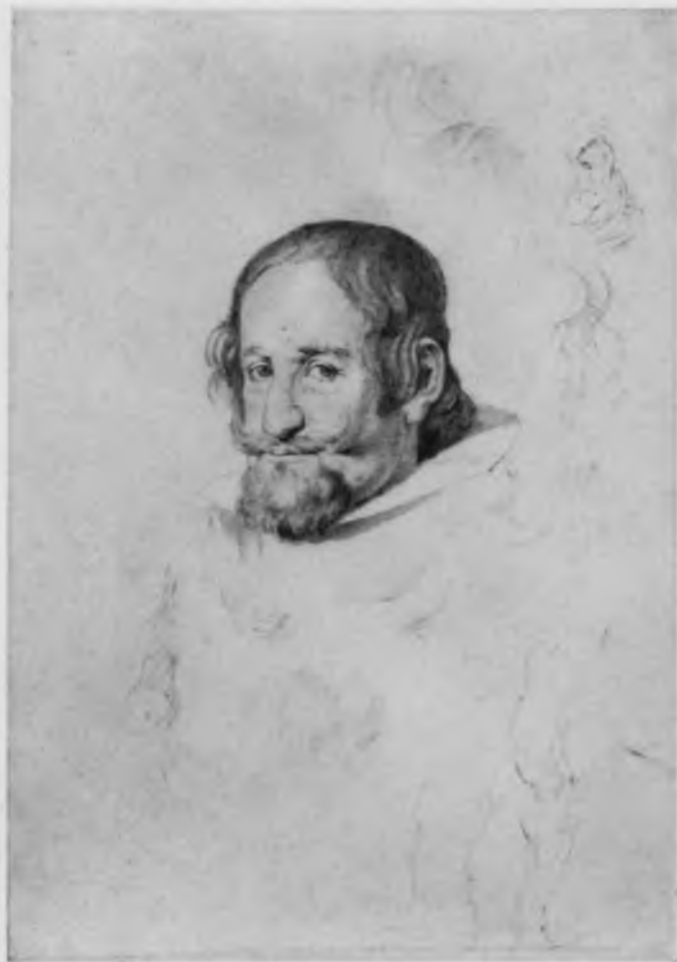
12. P. Pontius, Don Gaspar de Guzman, Count of Olivares and Duke of Sanlúcar , drawing. Rotterdam, Museum Boymans-van Beuningen