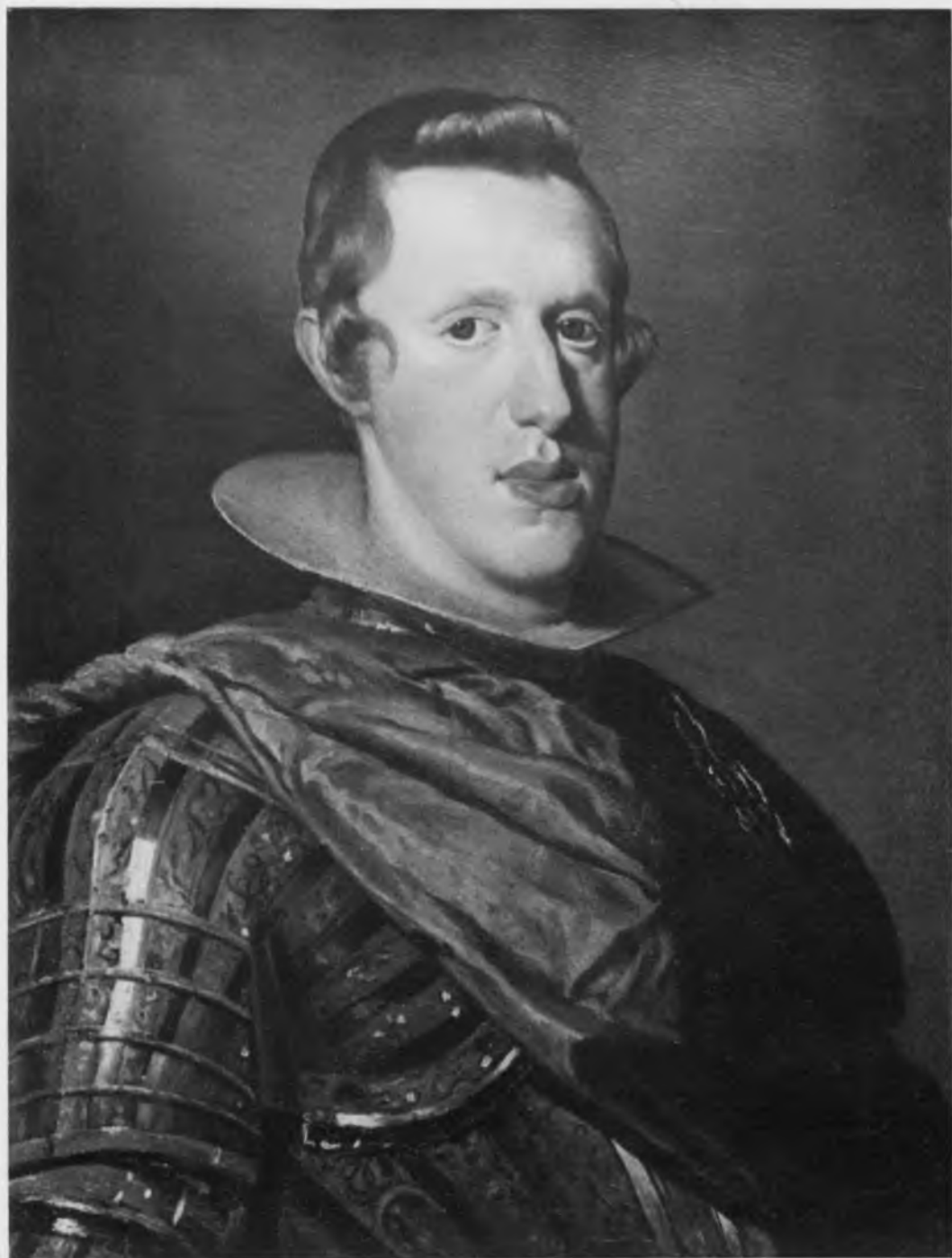
96. Velázquez, Philip IV, King of Spain . Madrid, Prado