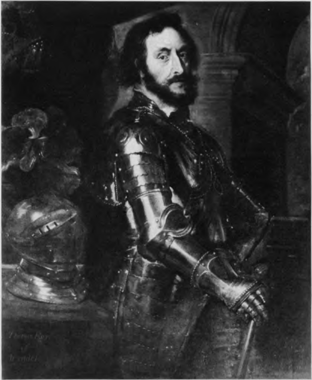
52. Rubens, Thomas Howard, Earl of Arundel (No. 5).

Boston, The Isabella Stewart Gardner Museum