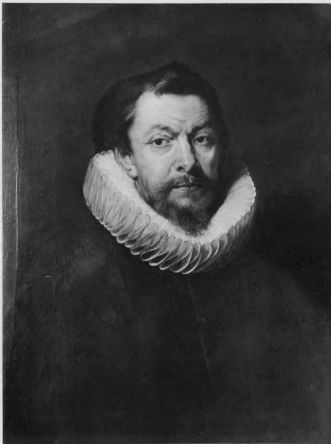
129. Rubens, Henri de Vicq, Seigneur de Menlevelt (No. 48). Paris, Louvre