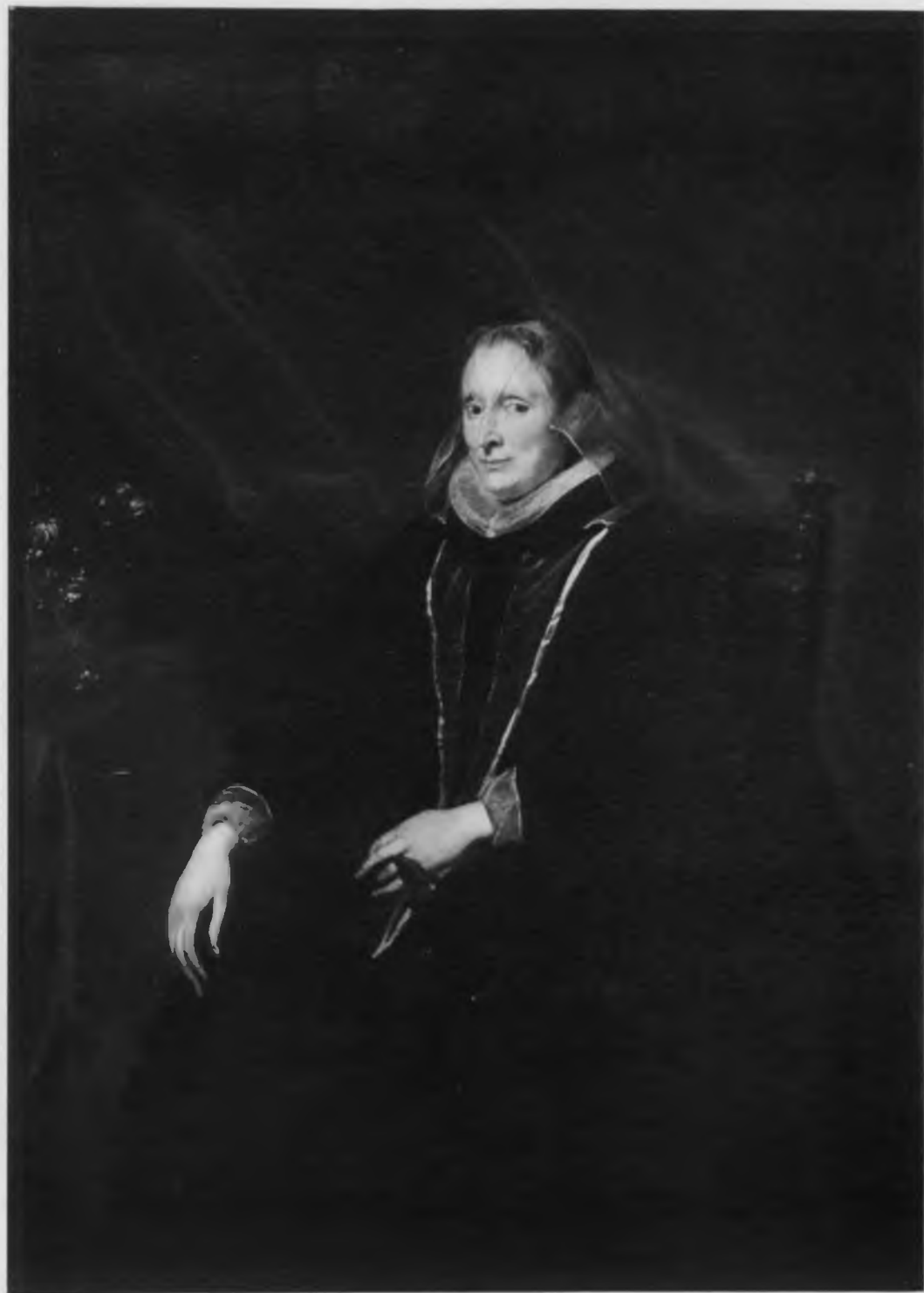
133. ? A. Van Dyck, An Old Lady (No. 57). Strasbourg, Musée des Beaux-Arts