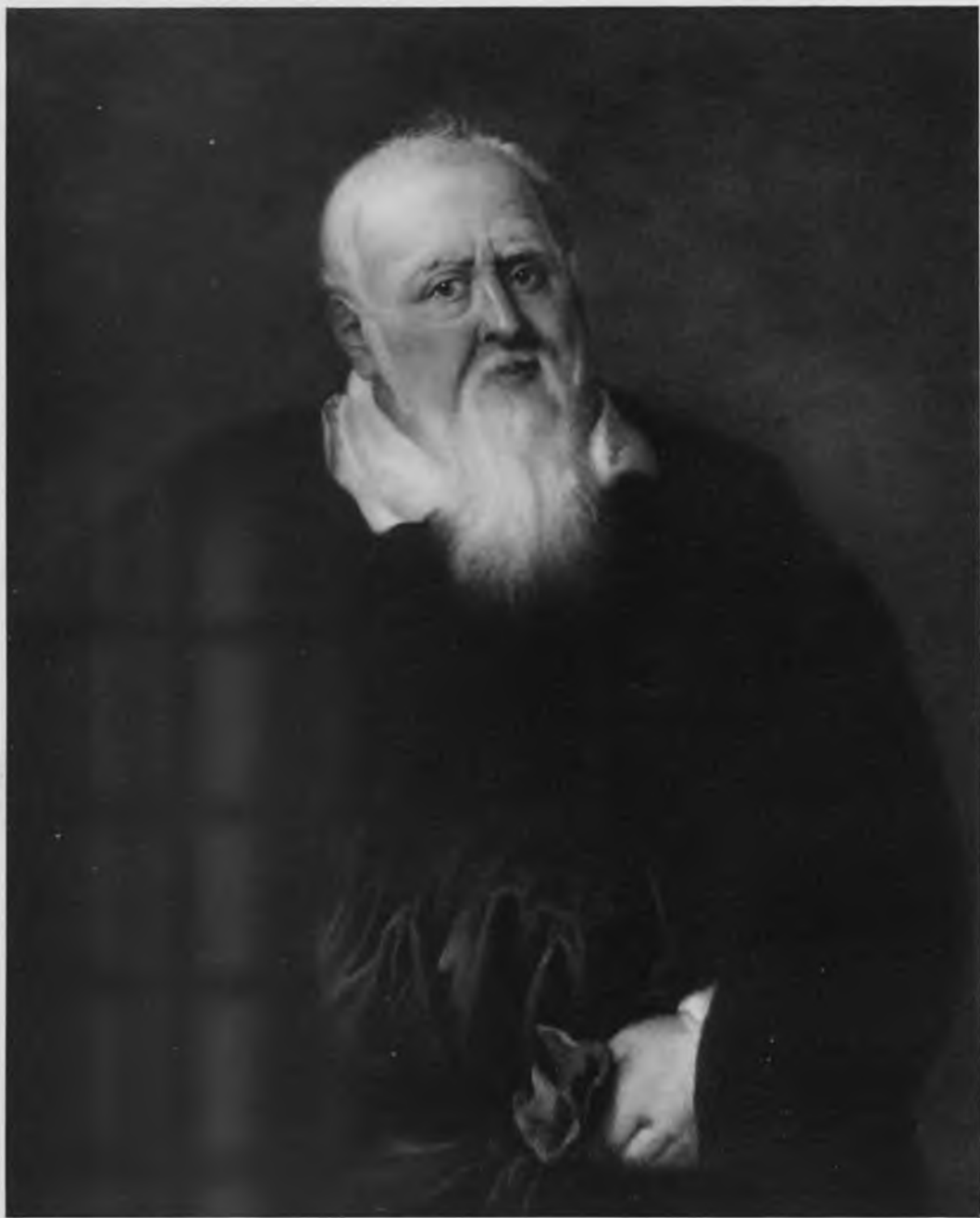
126. Rubens, Théodore Turquet de Mayerne (No. 46).

New York, New York University Art Collection