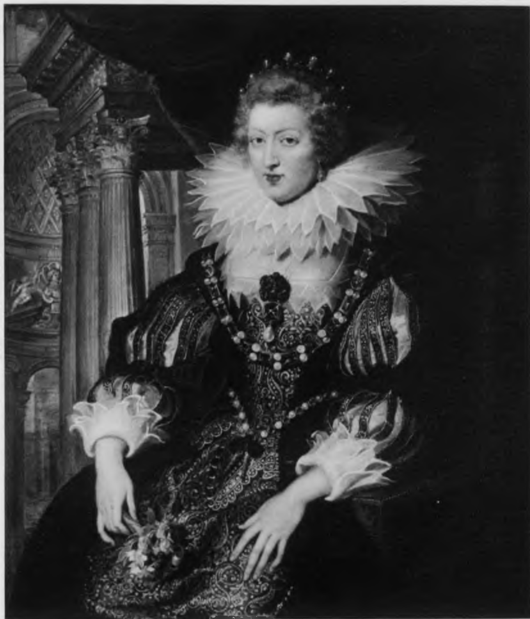
46. After Rubens, Anne of Austria, Queen of France (No. 3). Paris, Louvre