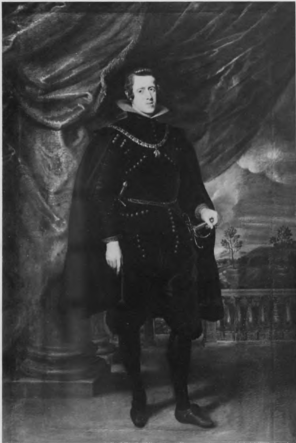
107. After Rubens, Philip IV, King of Spain (No. 33). Genoa, Galleria Durazzo Pallavicini