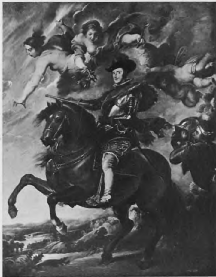
90. After Rubens, Philip IV, King of Spain on Horseback (No. 30). Photographic Reconstruction of the original Appearance of the lost Painting