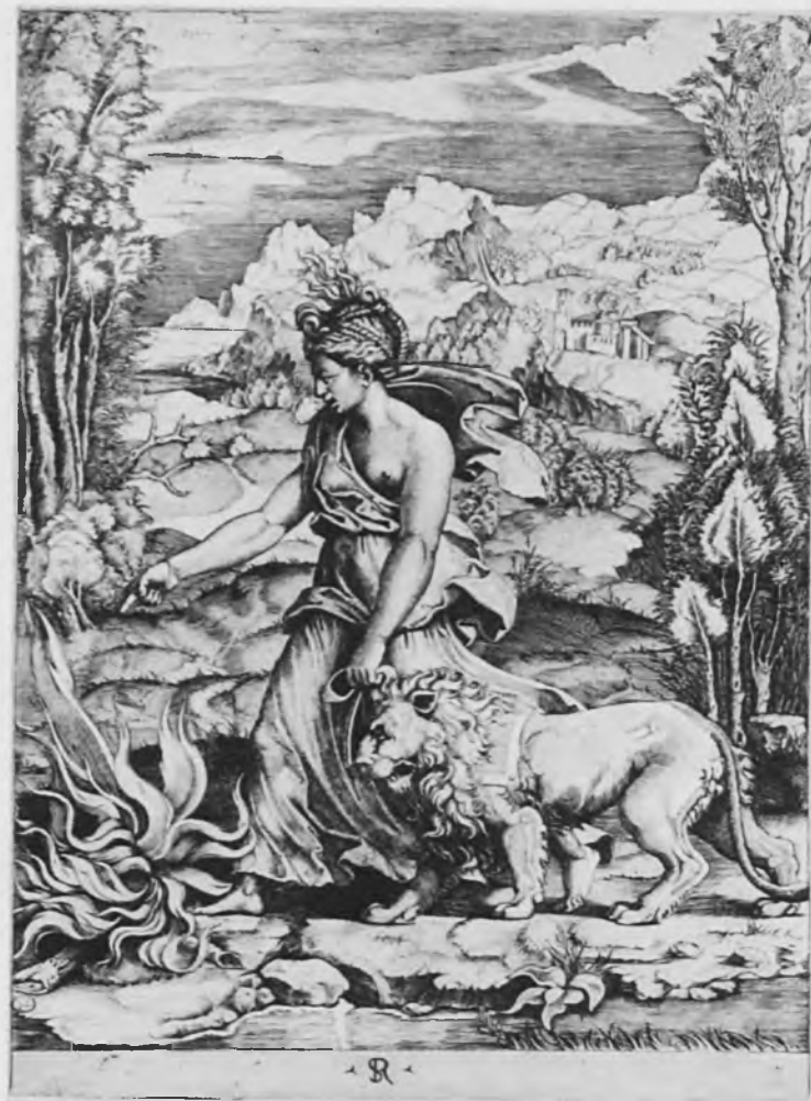
29. Marco Dente di Ravenna, Generosity (?) , engraving