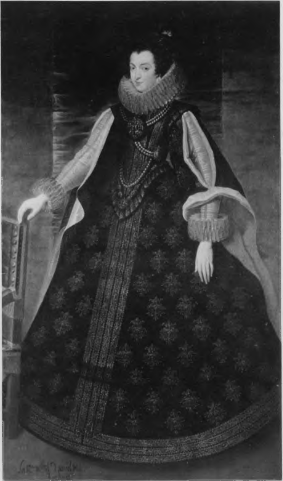
106. After Rubens, Isabella of Bourbon, Queen of Spain (No. 34). New York, Hispanic Society