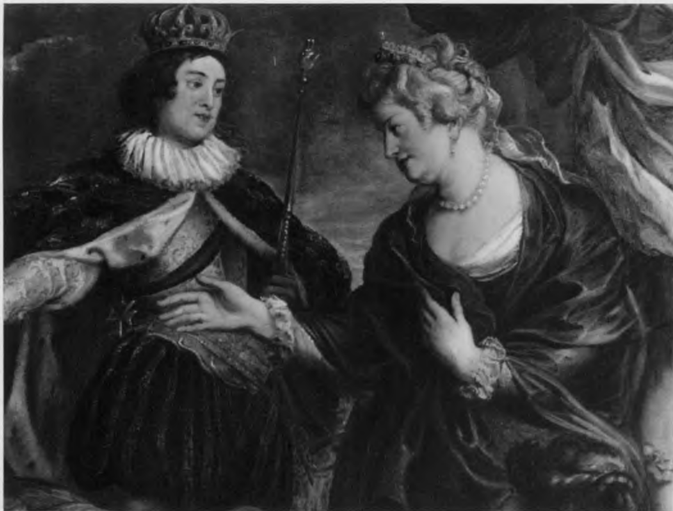
25. Rubens, The Coming of Age of Louis XIII (detail). Paris, Louvre