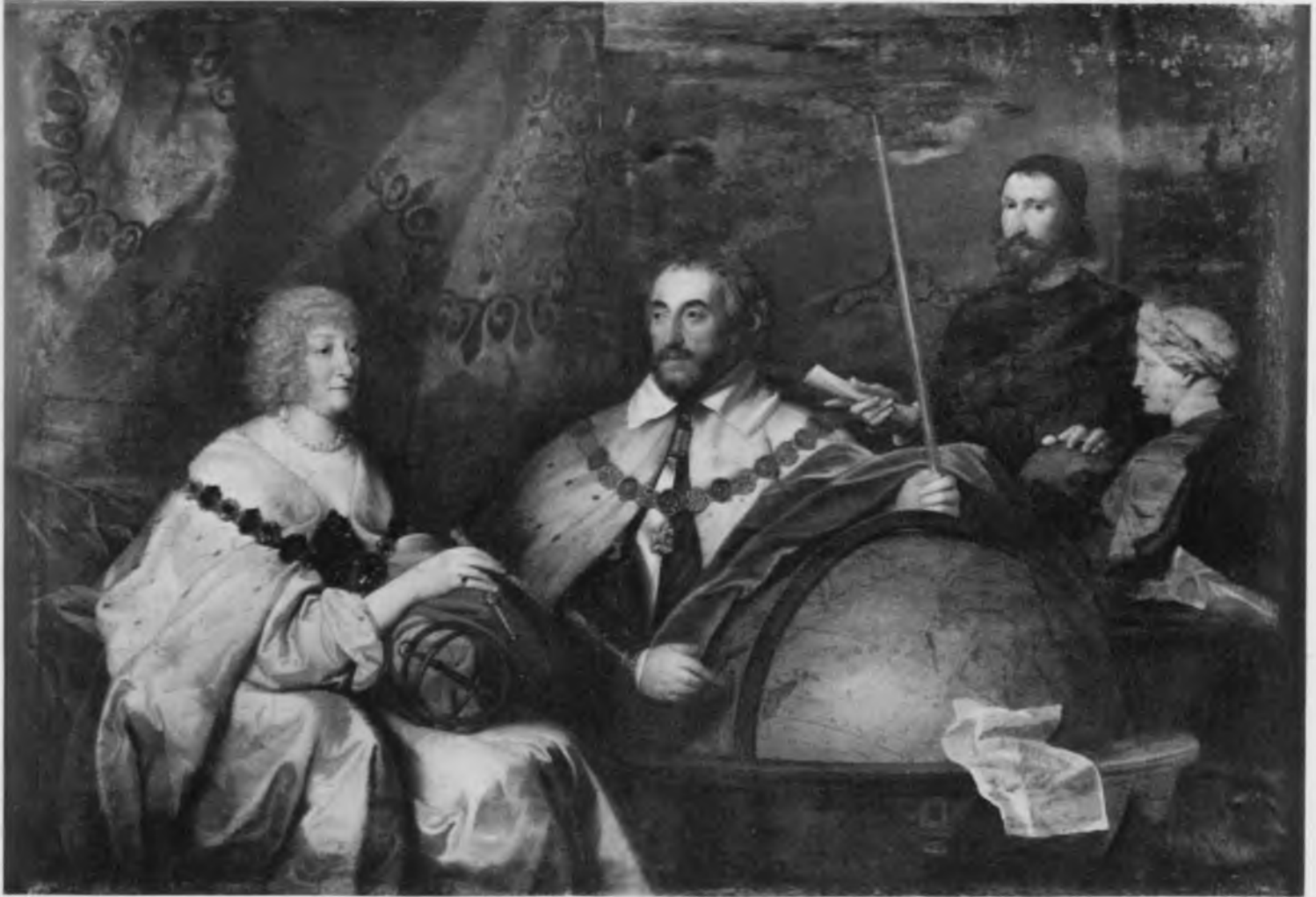
36. A. van Dyck, Thomas Howard, Earl of Arundel and his Wife, Aletheia Talbot . Knole, Lady Sackville