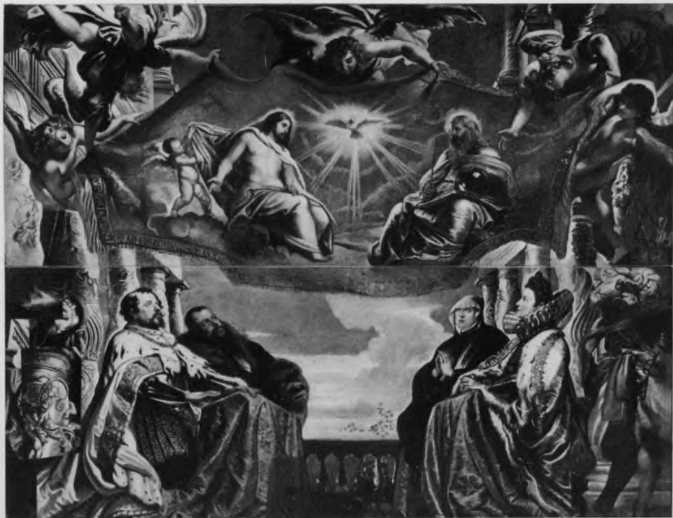
1. Rubens, Vincenzo Gonzaga and his Family Adoring the Holy Trinity . Mantua, Galleria di Palazzo Ducale