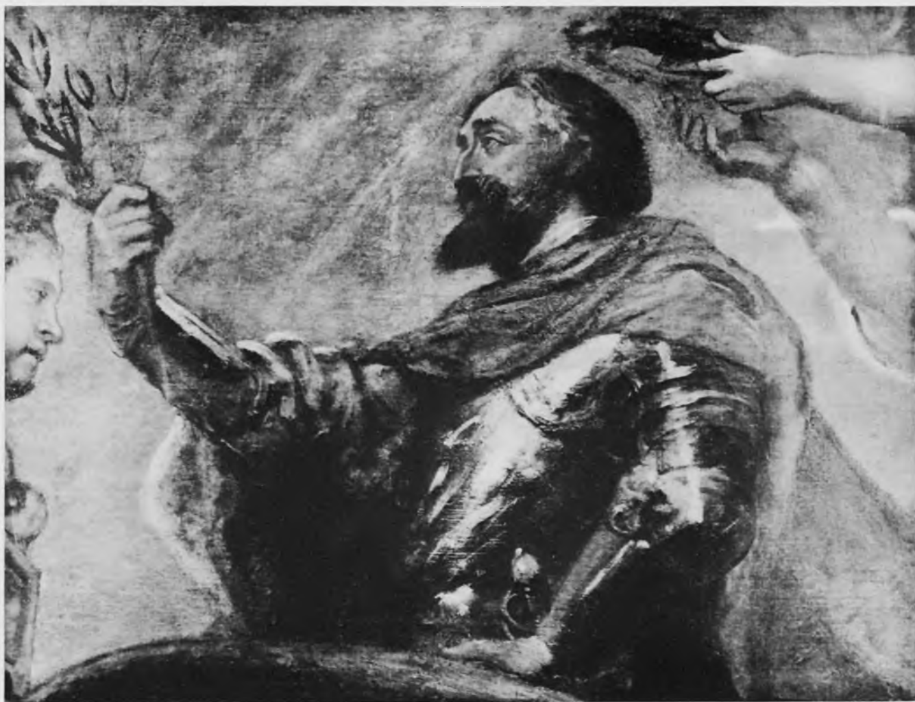
21. Rubens, The Triumph of Henri IV (detail). Florence, Uffizi