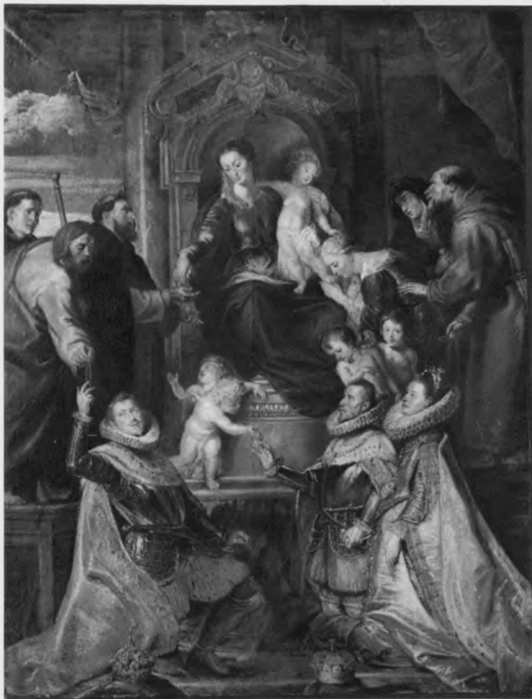
86. After Rubens, The Distribution of the Rosary . Present whereabouts unknown