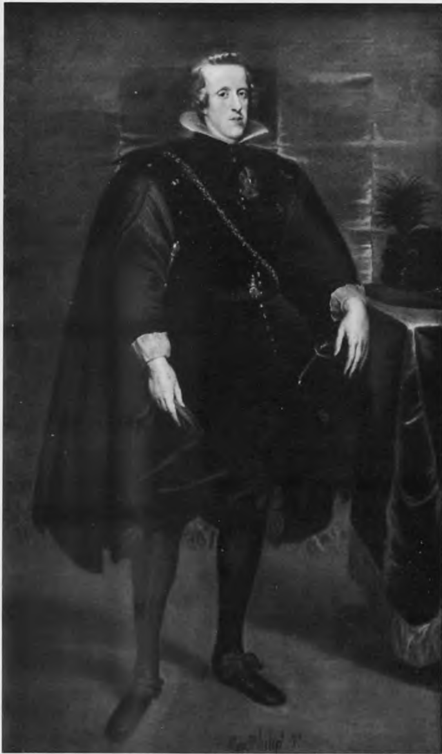
105. After Rubens, Philip IV, King of Spain (No. 33). Stratfield, Saye House, The Duke of Wellington