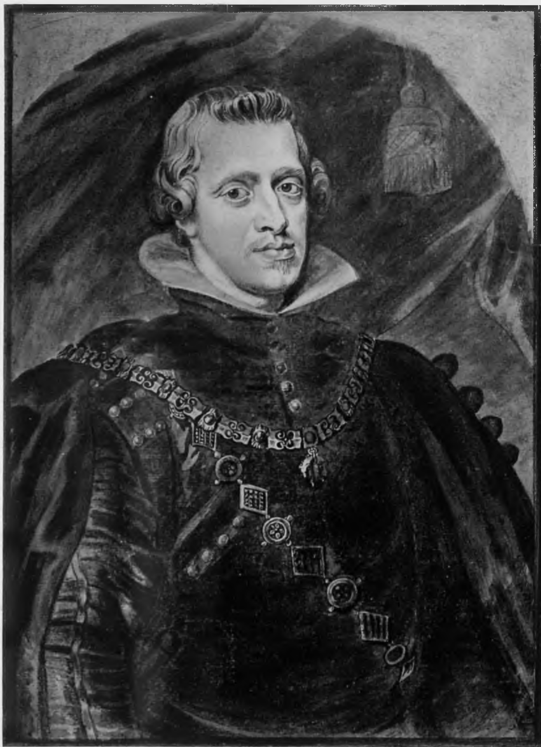
101. P. Pontius, retouched by Rubens, Philip IV, King of Spain , drawing (No. 33a).